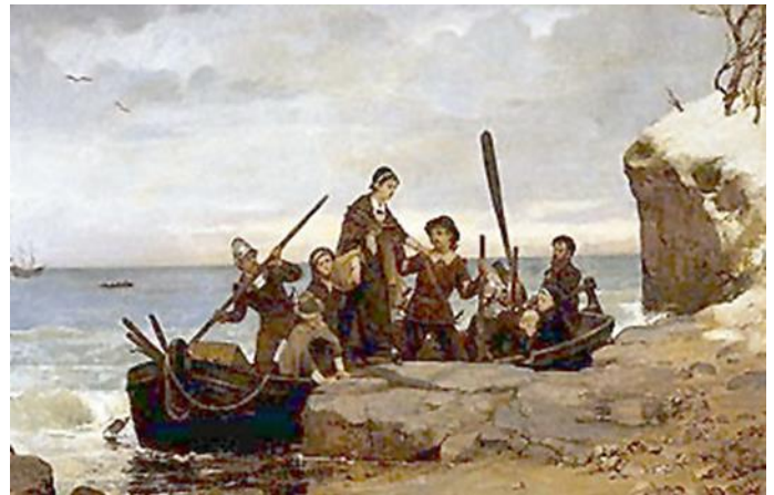
The Pilgrims go “Rock” hunting.

December 5 – Thursday Open Workshop, 6:30 – 9 pm – See Special Note.