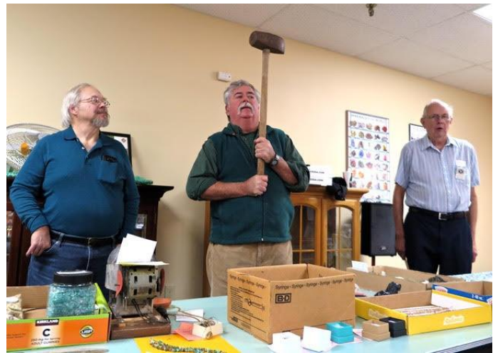
That's either Thor's hammer, or the new gavel for the president.