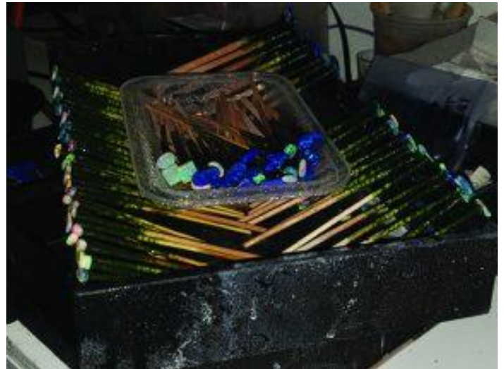
Results of an average day of cutting for Sawicki, who works in batches of between 50 and 100 stones at a time.

Opal is formed from a solution of silicon dioxide and water. As water seeps through sandstone, it picks up tiny particles of silica. Millions of years ago, the solution flowed into cracks and voids in the sediment as well as the volcanic areas of inland Australia. As the silica in solution was deposited and the water content gradually decreased, spheres formed in the gel. The spheres are formed by the particles of silica spontaneously adhering to other particles that form around them.