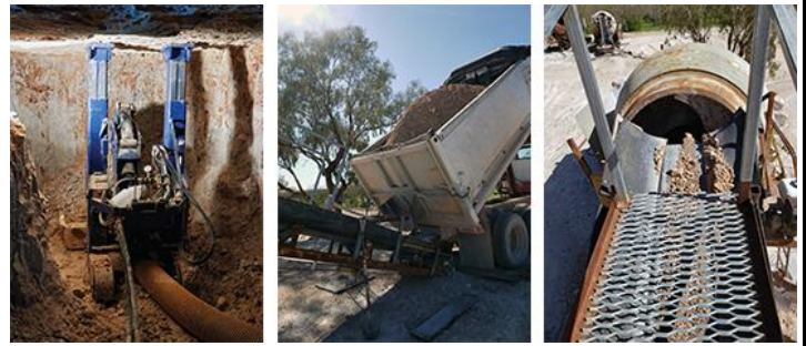
Illustration of the process Sawicki and the mining teams use to get the opal out of the ground into the truck, including the process of loading dirt into the aggie, "a cement mixture turned into a giant rock tumbler." (A&S Opals, LLC)

The Lightning Ridge area is a well-known center of mining black opals, as well as other opal gemstones. Sawicki is a supplier of both rough and finished opal and other Australian gemstones.