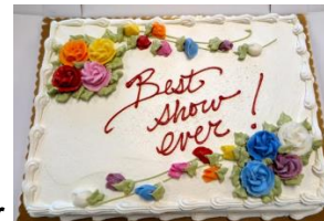
Appreciation Dinner

You can be part of this next year! Many volunteers will be needed for our 2020 show at the NY State Fairgrounds in July. Show Committee meetings will start in January.