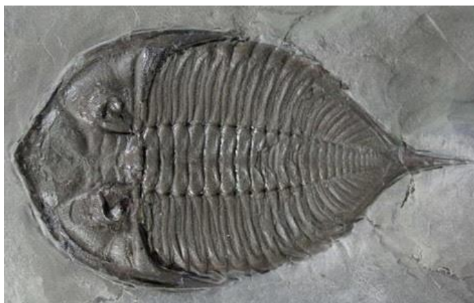
Trilobite, Dalmanites limulus Silurian, Middleport, NY

Trilobites were one of the most diverse type of marine invertebrates that lived during the Paleozoic Era. Their extremely important, archetypal fossils are symbolic of an archaic world that once dominated the ancient seas. They persisted for close to 300 million years -- almost twice as long as the dinosaurs -- but what made them so successful? What made them so unique? The sea is now gone, and New York State has become a goldmine for Devonian Trilobite hunters. If you missed out, now is your chance! We will have our complete Trilobite collection, along with our Dinosaur fossil collection on display and for sale on November 18!