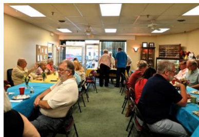
2019 GemWorld Show