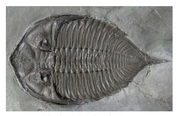
Trilobite, Dalmanites limulurus Silurian, Middleport, NY

Trilobites were one of the most diverse type of marine invertebrates that lived during the Paleozoic Era. Their extremely important, archetypal fossils are symbolic of an archaic world that once dominated the ancient seas. They persisted for close to 300 million years -- almost twice as long as the dinosaurs -- but what made them so successful? What made them so unique? The sea is now gone, and New York State has become a goldmine for Devonian Trilobite hunters. If you missed out, now is your chance! We will have our complete Trilobite collection, along with our Dinosaur fossil collection on display and for sale on November 18!