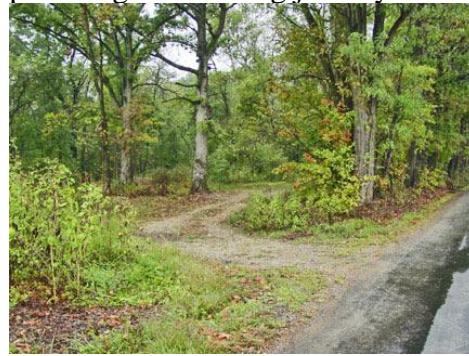
The path into the quarries.

a good laugh! Now it's time to get to work cutting and polishing and making jewelry.