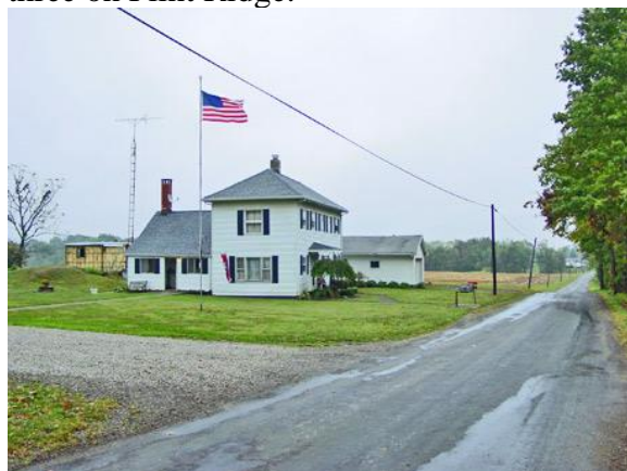
Nethers' Farm

Flint is a variety of microcrystalline quartz. It resembles chert in that both are granular varieties. The dark siliceous nodules are called flint and the lighter colored deposits are called chert. Chalcedony is a general term which is applied to fibrous varieties of microcrystalline quartz. We found specimens of all three on Flint Ridge.