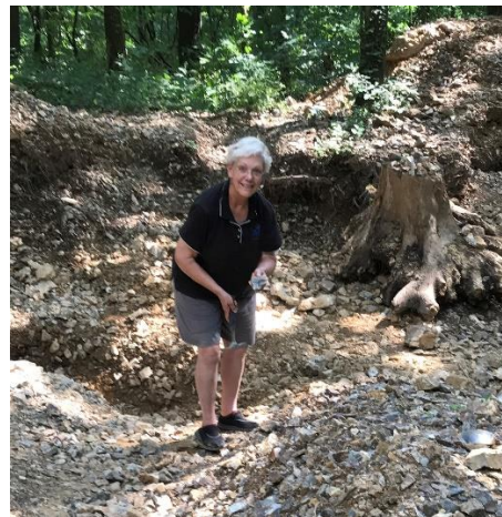
In the rock pile