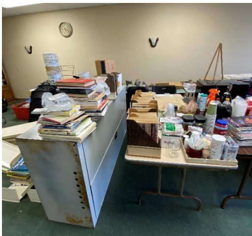
Storage Cabinet on its Side

After turning off the water and the power to the water heater, we called the landlord and then Stanley Steamer. While we waited for them to arrive, we emptied the storage cabinet and moved it past the soaked carpet. We didn't know about the library yet.