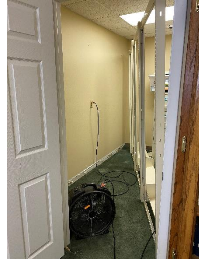
Library with Bookshelf Removed

so they could lift the carpet and remove the soaked pad.