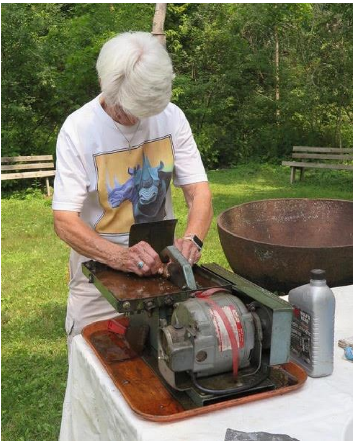
A number of Club members tried their hand at successfully cutting their own geodes.