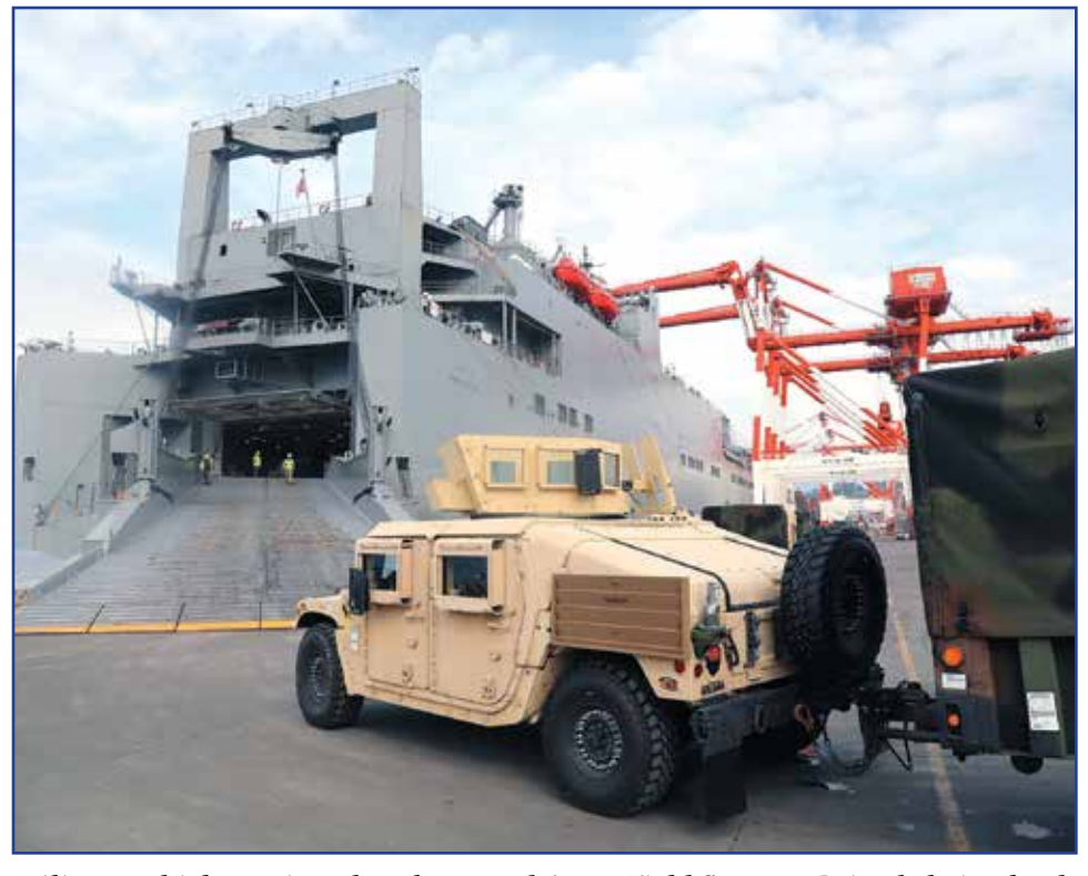
Military vehicles assigned to the 402nd Army Field Support Brigade being loaded to the USNS Red Cloud at Subic Bay.

The AFP and U.S. military also conducted multiple humanitarian and civic assistance projects, including the renovation of four elementary schools, multiple community health engagements, and the exchange of advanced emer-