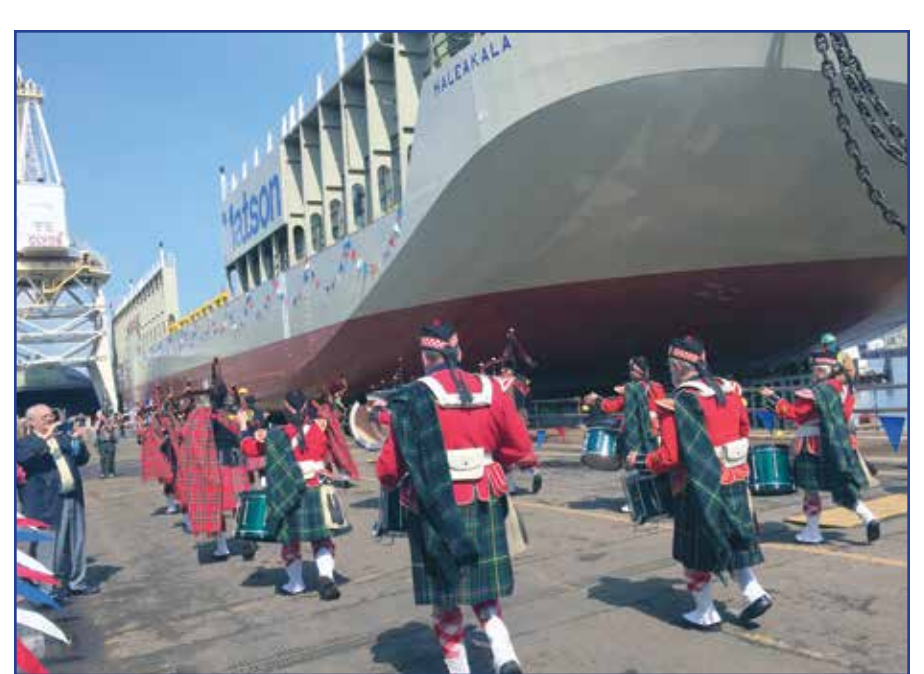
The Clan Macleay Pipe Band led the march to the ceremony site.