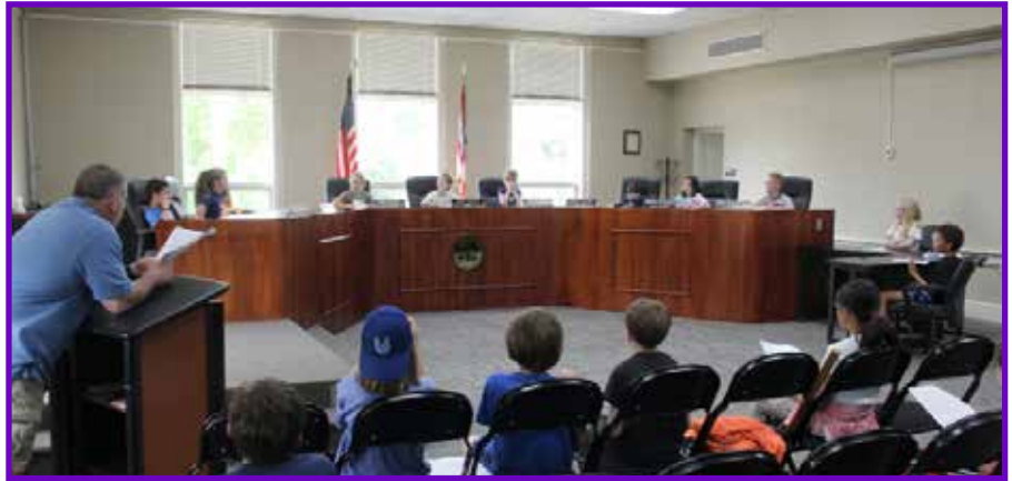
Third graders sitting in the council seats.

Twenty years ago your Wyoming Historical Society, in partnership with Wyoming Schools, began the yearly 3rd Grade Tours. The tours consisted of a school day packed with tours, information, bus rides, information and lunch in the Oak Street gym. The State mandated curriculum says that 3rd graders should learn about their community. And for twenty years we have done that. The students learn about our Water Works, Public Works, City Council, Historical Society, History Museum, a bus trip to learn about the Canal and environs and a stop at the Reilly house to learn about the naming of Wyoming. While over the years the logistics have changed some, it was always a highlight of the 3rd grade year.