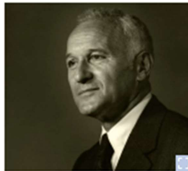
CIA chemist Sidney Gottlieb headed up the agency's secret MK-ULTRA program, which was charged with developing a mind control drug that could be weaponized against enemies.

"Gottlieb wanted to create a way to seize control of people's minds, and he realized it was a two-part process," Kinzer says. "First, you had to blast away the existing mind. Second, you had to find a way to insert a new mind into that resulting void. We didn't get too far on number two, but he did a lot of work on number one."