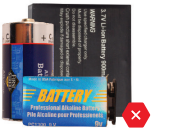
NO Batteries Check local drop-off programs for proper disposal NO baterías - Verifique los programas locales de entrega para su correcta eliminación