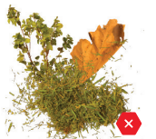
NO Green Waste NO desechos verdes