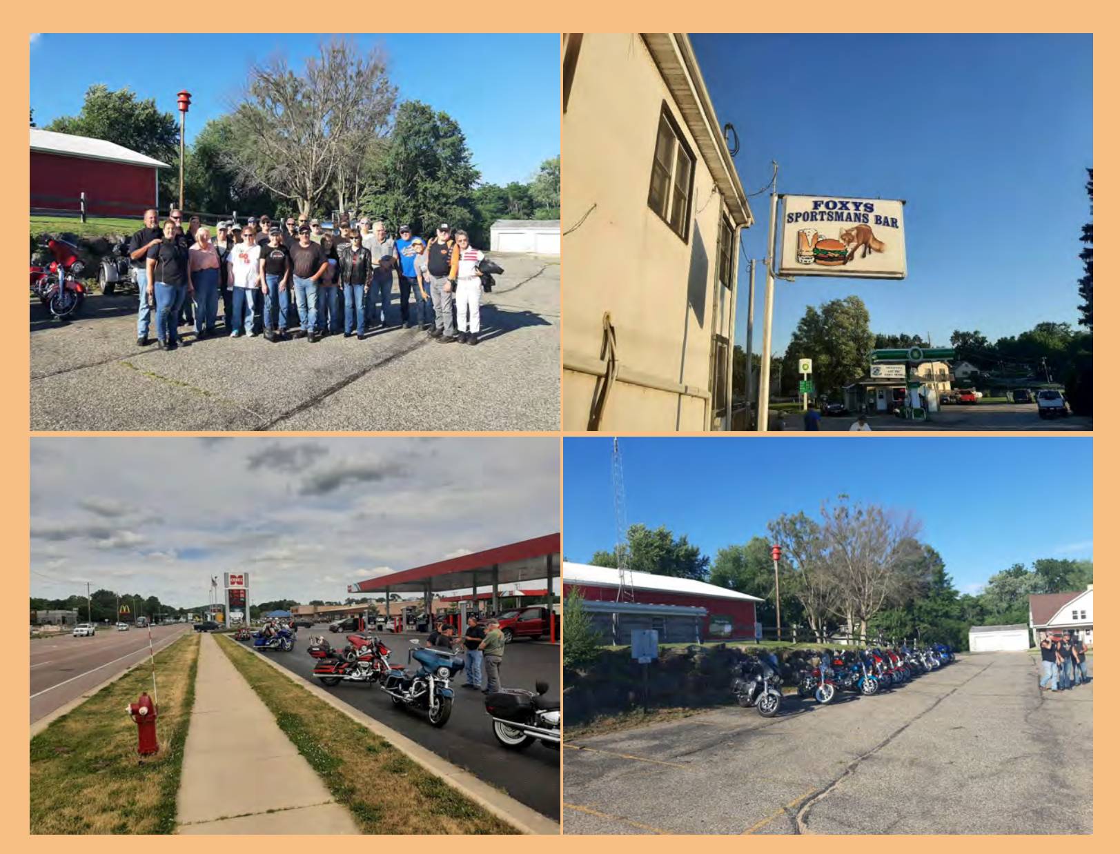
Briggsville Ride July 1st