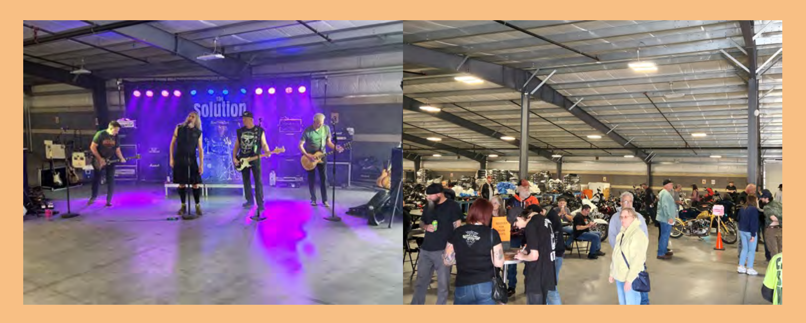
Bike Show June 11th