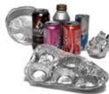
Aluminum Cans & Foil (Latas de aluminio y