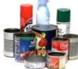
Steel and Tin Cans (Latas de hojalata