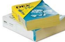
Phone Books (Directorios)