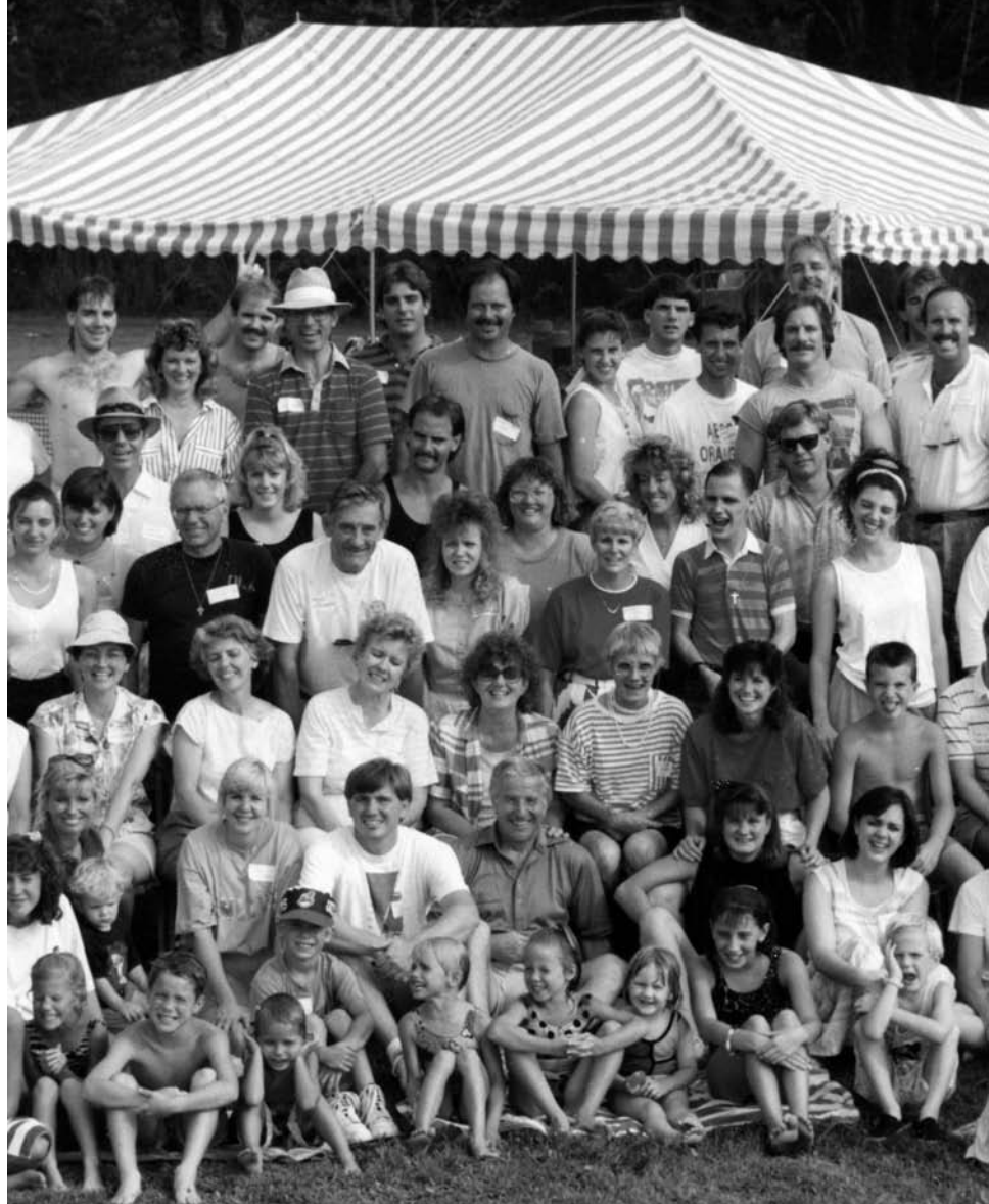
COUSINS BY THE DOZENS! 1990, VALLEY CITY, OHIO