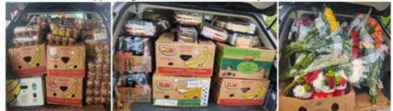
Food Recovery in 5Cities & SLO to support Prado Shelter, local pantries & recovery homes

Service is doing what is needed to benefit our local community, giving our time, efforts and hearts to help children, families, schools and non-profit organizations. I'm SO proud of our Club and what we have accomplished!