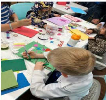
Providing Quarterly Crafting Events @ Oceano Library