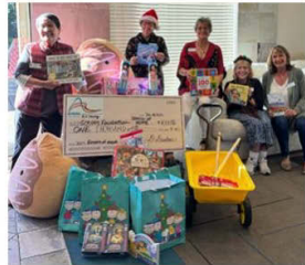
Supporting KSBY Season of Hope