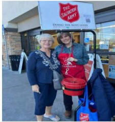
Salvation Army Bell Ringers

WHY I LOVE ALTRUSA SERVICE PROJECTS...PICTURES ARE WORTH A THOUSAND WORDS!