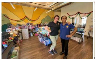
Supporting 5Cities Homeless Coalition (SCHC) Santa's Toy Shop and Winter Wishes