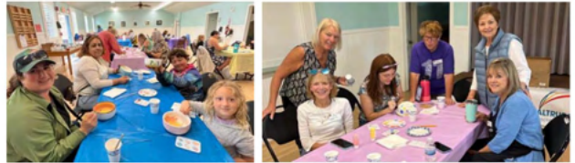
Supporting SCHC with Painting Parties for Empty Bowls Fundraiser