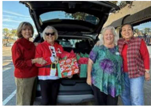
Holiday Cheer for Casa Solana, Captive Hearts & Resilient Ones