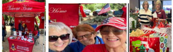
Supporting Welcome Home Military Heroes