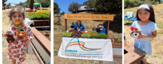
Supporting Camp AG Jamboree with Altrusa Planting project & books