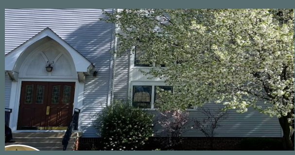
Website: <a href="https://stpeterslutheranchurch.com">https://stpeterslutheranchurch.com</a>