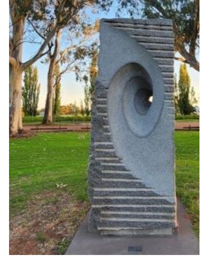
Centenary sculpture

Griffith is one of Australia's most vibrant cosmopolitan centres, a community with a rich blend of cultures and traditions. More than 60 nationalities from all over the world call Griffith home, with a population of over 26,000.