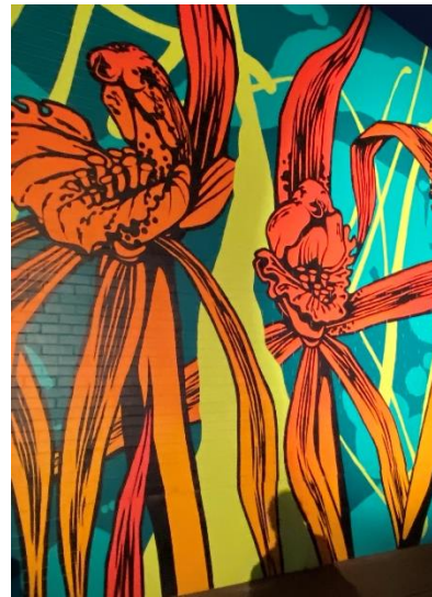
Banna Lane Murals