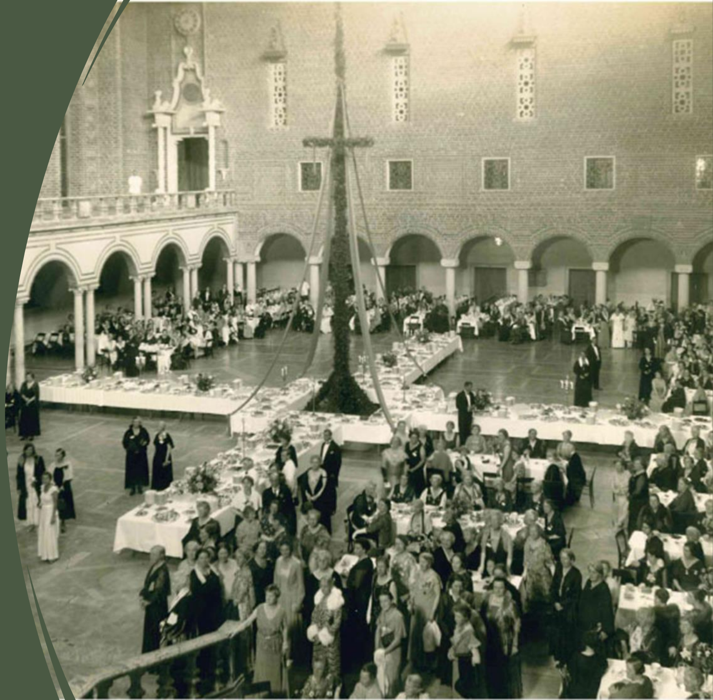
Photo: Second Triennial World Conference held in Stockholm, Sweden, in 1933.