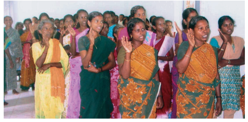
INTEGRATED EDUCATION & Development Society (IEDS), India applied for and received grant assistance to carry out a full-fledged Kanikkar Tribal Women's Cooperative Development

project, where IEDS successfully carried out all the activities envisaged in the project. This report carries information on the results, successes and impacts of the project during the first six months.