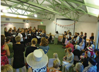
Wells WI Garden party