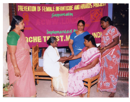
Peer Educators Programme - role playing.

The conclusion was to develop a way for the rural women to learn about personal actions, directed at themselves and at others. Actions which, when learned, would show these women how to change their surrounding environment in a healthy and safe way, allowing them to live fulfilling productive lives.