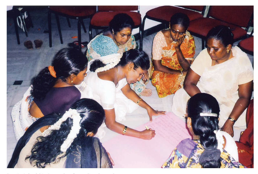
Female Infanticide Prevention Group Exercise project

The life skills education session encouraged and enabled the women to acquire the following skills: