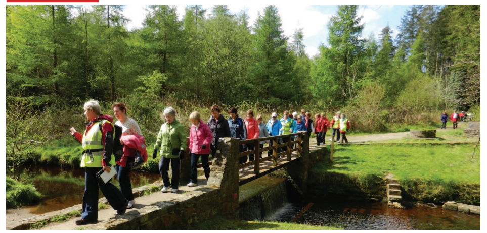
Above: The winning photo for the Women Walk the World Competition - Clogher Women's Institute and Monaghan Federation Irish Countrywomen's Association (ICA), Ireland. Below: Some of the members pictured on their walk.