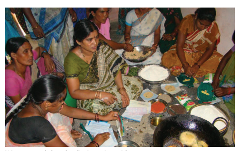
Women training in flatbread making

The women are currently selling their produce at the Saturday and Sunday markets in Kamalapuram Town and Yerraguntla Town, which are just 3kms away from their villages. The towns are the central points where the surrounding town and