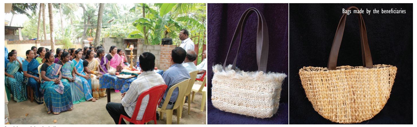
Receiving training in India