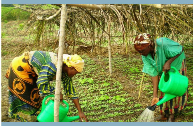
Five rows of peas: Patience, Promptness, Preparation,

Squash: Squash gossip, criticism and indifference.