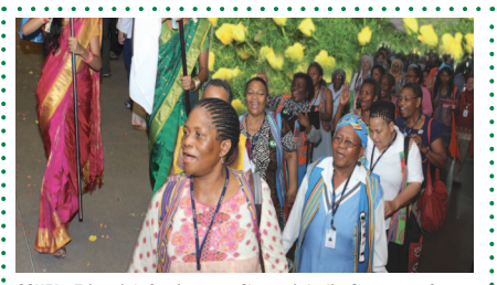
COVER: Triennial Conference, Chennai India-See page 8

ACWW Connects & Supports Women & Communities Worldwide