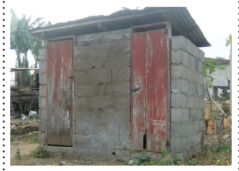
CAMEROON Water & Sanitation (Provision of Safe Water and Toilets for Rural Communities)

Organisation: Unique Child Common Initiative Supported by: Manitoba WI, Canada