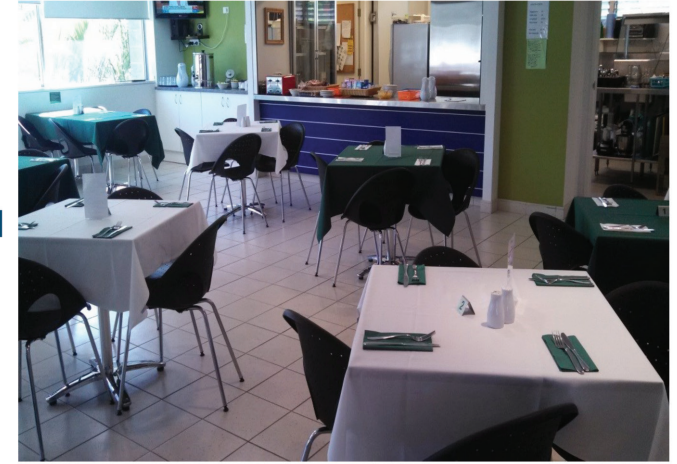
Breakfast, afternoon tea and dinner dining

Centrally located within walking distance of the City and main railway station Airport shuttle right to and from the front door Regular, free Brisbane City Loop bus a 5 minute walk from the door