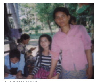
CAMBODIA Rural women livelihood development Organisation: Hope Association for Development (HAD) Supported by: Cheshire FWI, Isle of Wight FWI, England

The aim of this project was to improve the living conditions of the poorest womenheaded families and vulnerable groups in order to give them opportunities to generate income. The project run by the Hope Association for Development (HAD) and which ran in 24 villages, benefitted 440 women and 14 men.