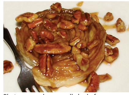
Photo: caramel pecan roll - kcchef.com OVERNIGHT CARAMEL- PECAN ROLLS