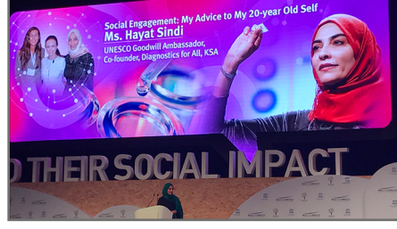
Two of the inspiring speakers at #UNESCOMiSK

What became immediately obvious as the sessions began and interventions were welcomed from the floor of the Forum, was that delegates were welcome to engage and comment on any topic, and without reservation. The role of women in our global community, and particularly the developing and broadening role played by women in Saudi society was a large part of this discussion, with most speakers referring to the crucial input of women at every level.