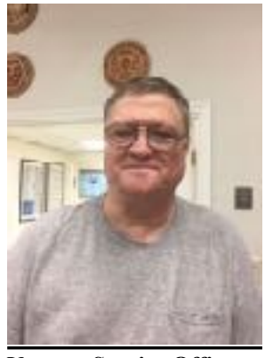
Veteran Service Officer: