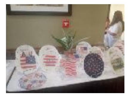
Ladies Auxiliary items for Sale!