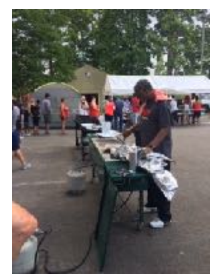
Waiting in Line!!