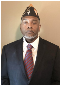
The Prez Sez:

Shipmates: Veterans Day is approaching, a day that's particularly important