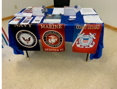
FRA Information Table

available at this time and will be published later.