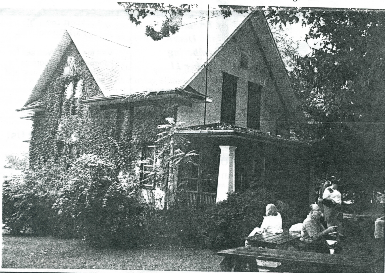
Guests on the front lawn at The House In The Park on August 24.