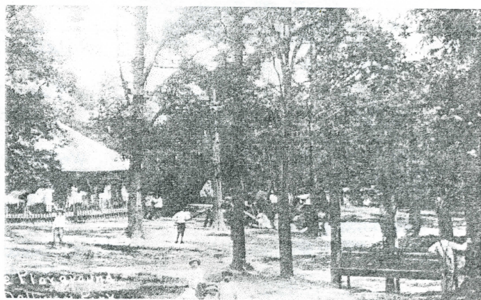
"The Playground, Dellwood Park, Joliet, Ill."