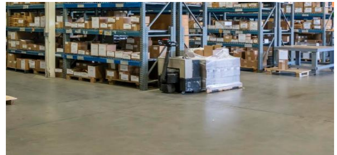
Light duty warehouse floors

The basics, prep, prime coat, build up coat and topcoat. Pro-Seal PowerKote I ® is for light duty parking decks, light duty decks, and light duty warehouse floors