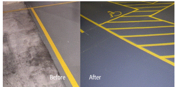
Durable light utility and garage floors

The basics, prep, prime coat, build up coat and topcoat. Pro-Seal PowerKote I ® is for light duty parking decks, light duty decks, and light duty warehouse floors