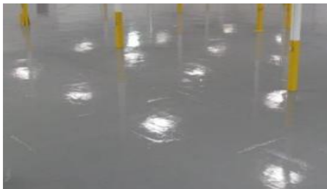
Warehouse floors where chemical storage occurs

We warrant our product to be free of defects in material and workmanship; and to be in accordance with our company quality control standards. All data, statements, and recommendations made herein are based upon information we believe to be reliable, but are made without any representation, guarantee, or warranty of accuracy. Our products are sold on the condition that the user himself will evaluate them, as well as our recommendations, to determine their suitability for the user's own purpose before adoption. Also, statements regarding the use of our products or processes are not to be construed as recommendations for their use in violation of any patent rights or in violation of any applicable laws or regulations. Liability under any condition shall be limited to replacement of material only.