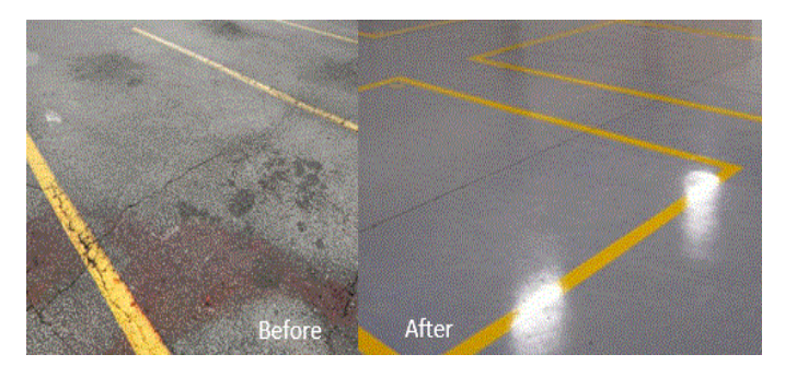
Light duty parking garages