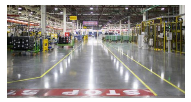
Light duty Warehouse floors where chemical storage occurs

Pro-Seal PowerKote I® topcoat finishes a PowerKote I® Systems durable light duty versatile coating.