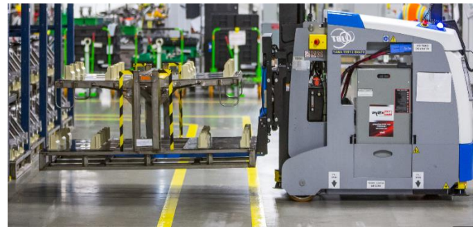
Durable light utility and warehouse floors

The basics, prep, prime coat, build up coat and topcoat. Pro-Seal PP/PK I topcoat ® is quick and easy to apply over Pro-Seal PowerKote I build up coat.