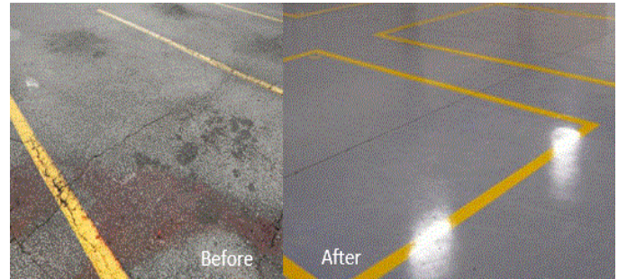
Light duty parking garages

The basics, prep, prime coat, build up coat and topcoat. Pro-Seal PP/PK I topcoat ® is quick and easy to apply over Pro-Seal PowerKote I build up coat.