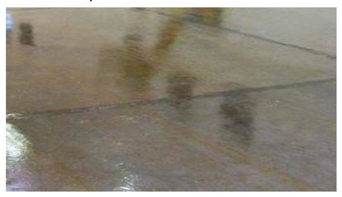
Durable utility floors