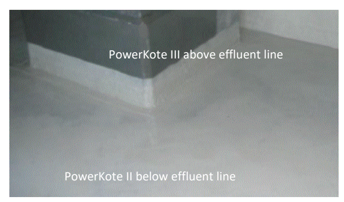
Pro-Seal PowerKote Systems durable chemical resistant coatings

The basics, prep, prime coat, build up coat and topcoat. Pro-Seal PP/PK II primer <sup>®</sup> is a priming base for resistance to the harsh fluids below the effluent line, below, in this coolant collection tank.