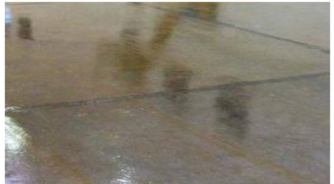
Durable utility floors

The basics, prep, prime coat, build up coat and topcoat. Pro-Seal PP/PK II primer ® is a priming base for resistance to the harsh fluids below the effluent line, below, in this coolant collection tank.