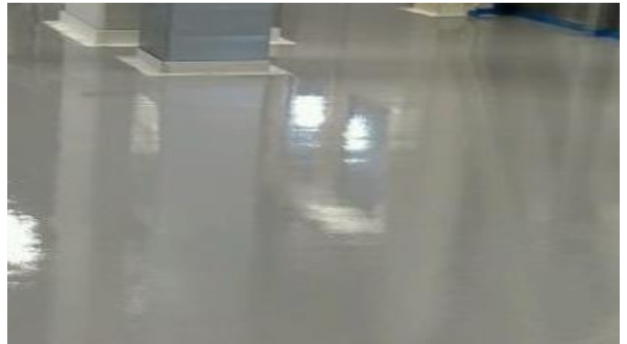
Durable utility floors