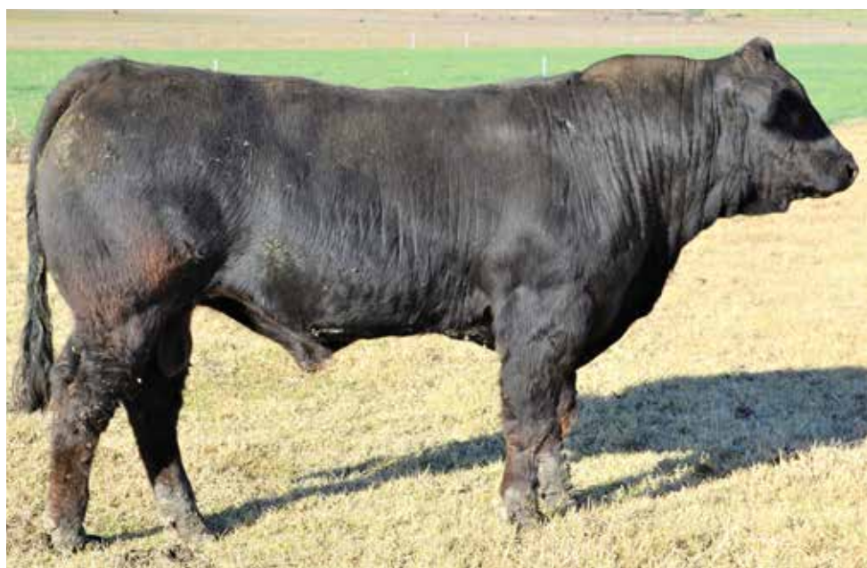
LOT 4 HARLEES DENVER S53 (PP B AA)