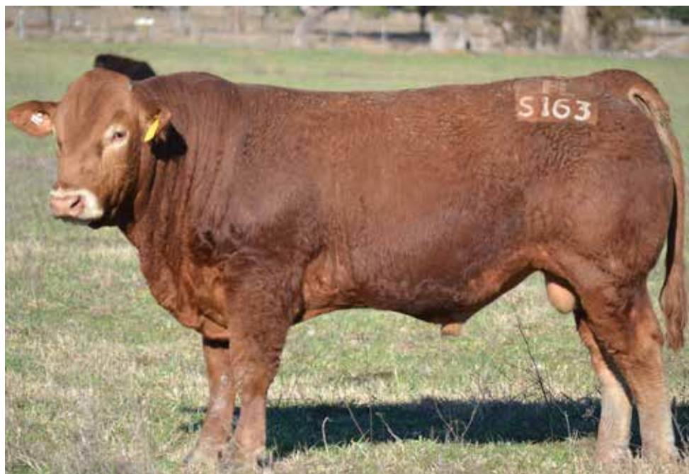
LOT 14 HARLEES S163 (P A AA)