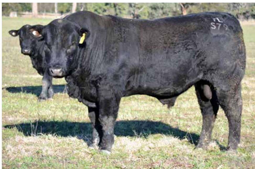
LOT 2 HARLEES SNIPERS79 (PP B AA)