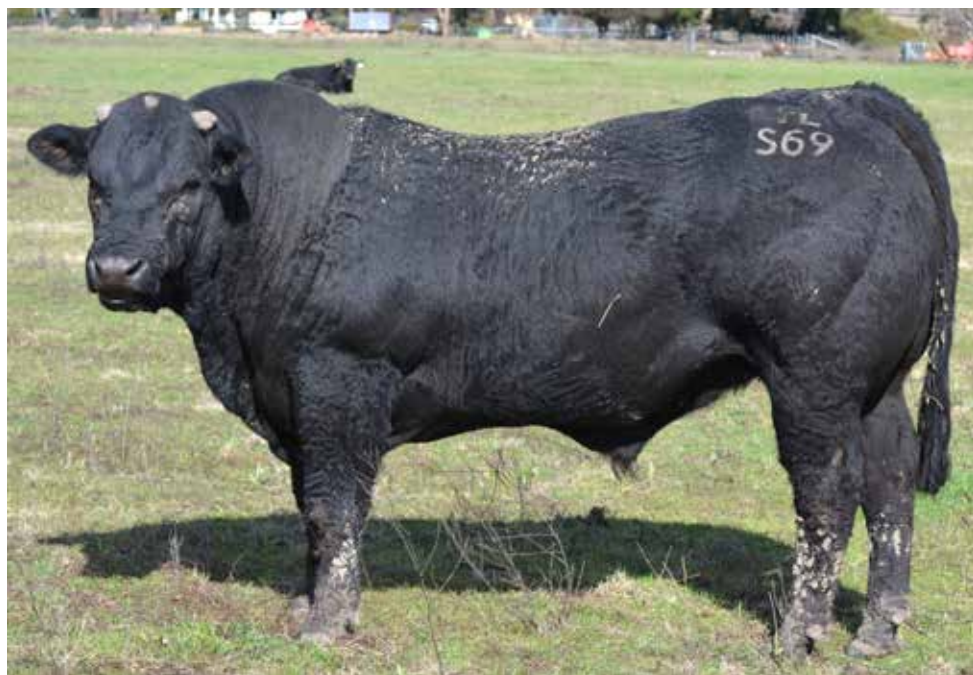
LOT 7 HARLEES DENVER S69 (P B U)