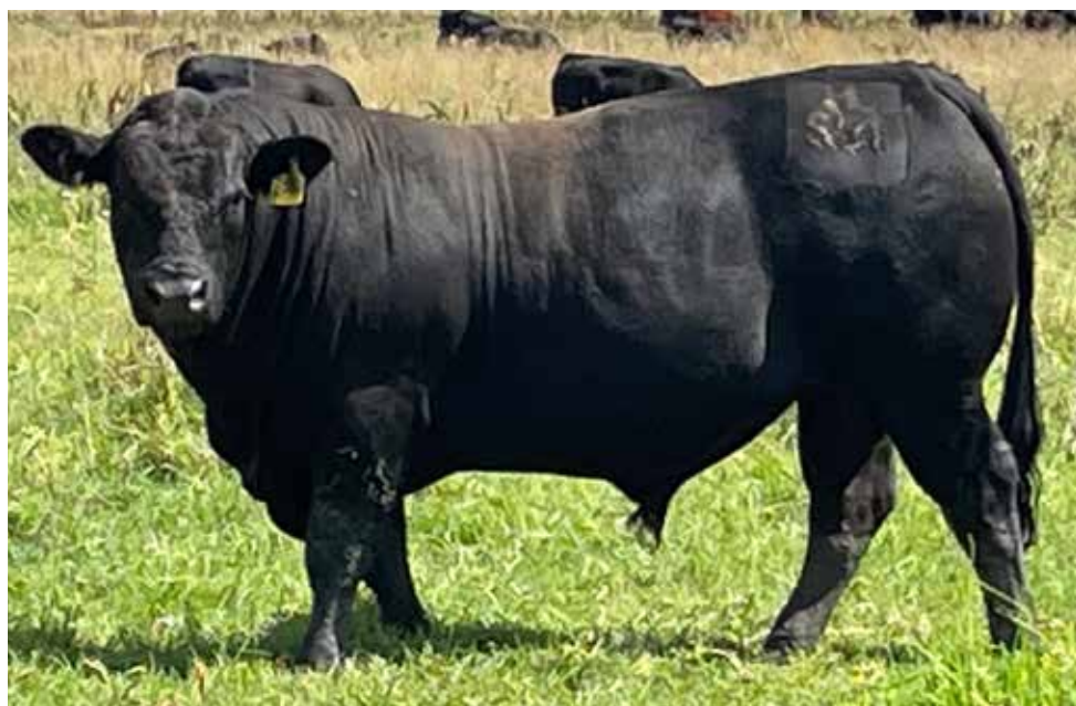
LOT 16 HARLEES SAM S51 (PP BB AA)