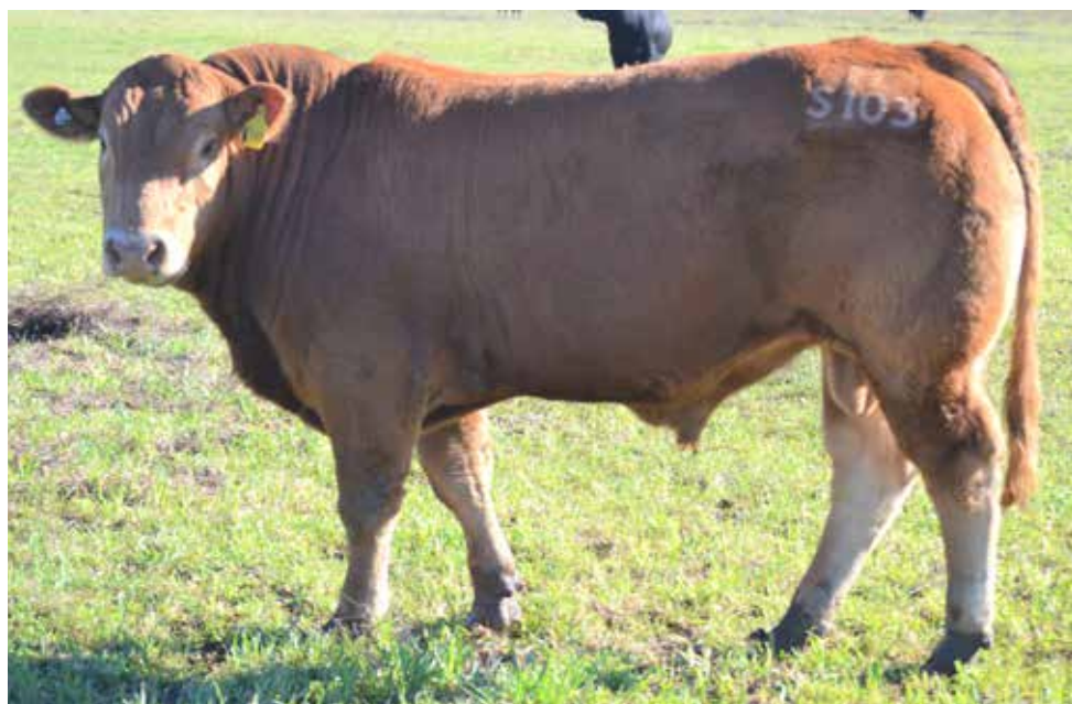
LOT 12 HARLEES SCOTT S103 (PP A AA)