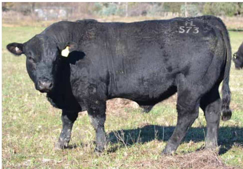
LOT 1 HARLEES LIFTOFF S73 (P B AA)