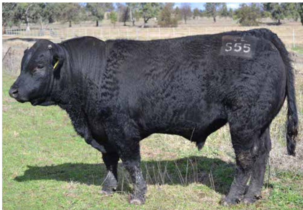
LOT 3 HARLEES MANDATE S55 (P B AA)