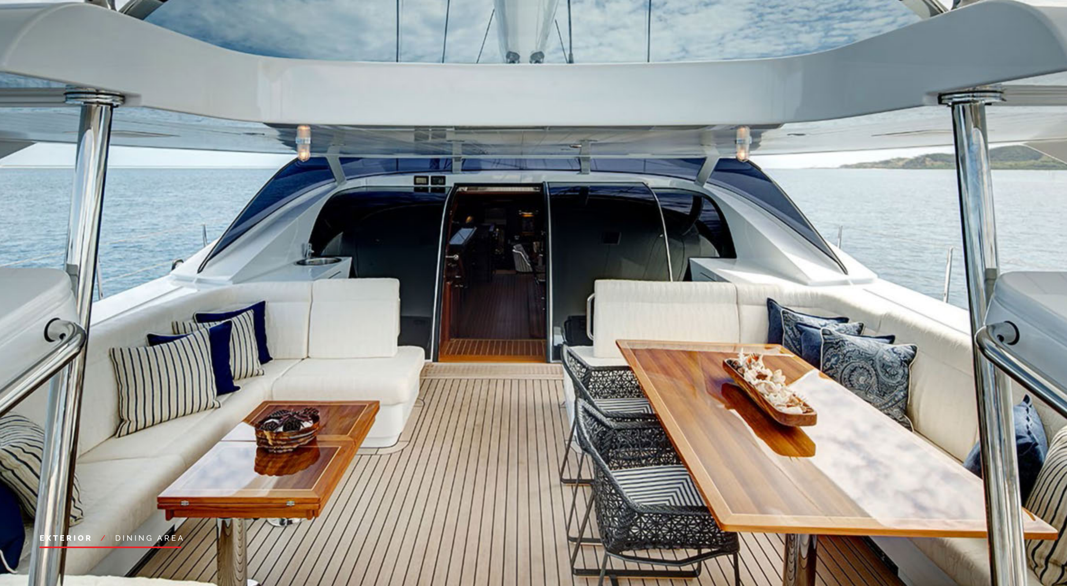
EXTERIOR / DINING AREA