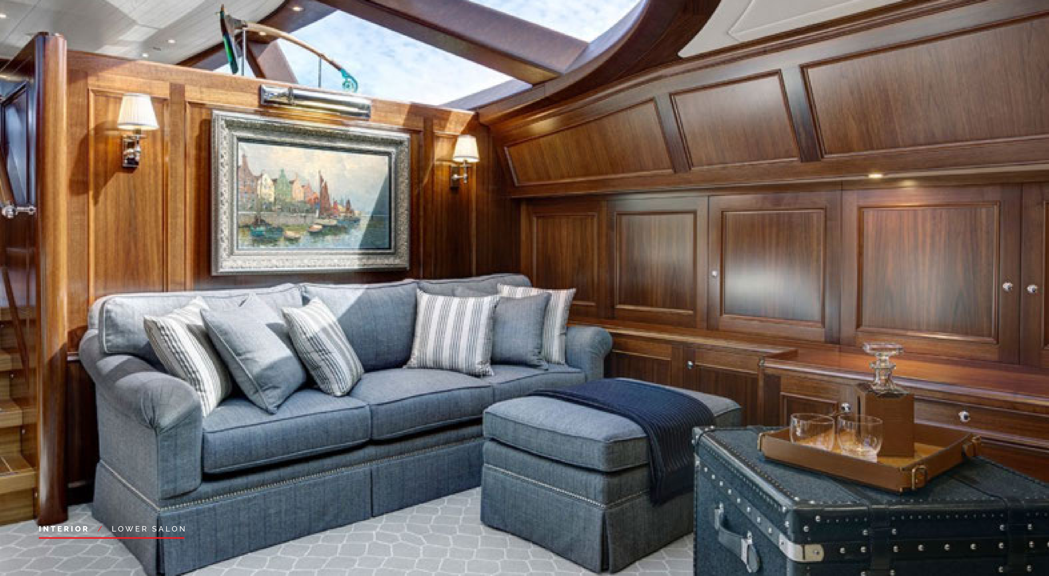
INTERIOR / LOWER SALON