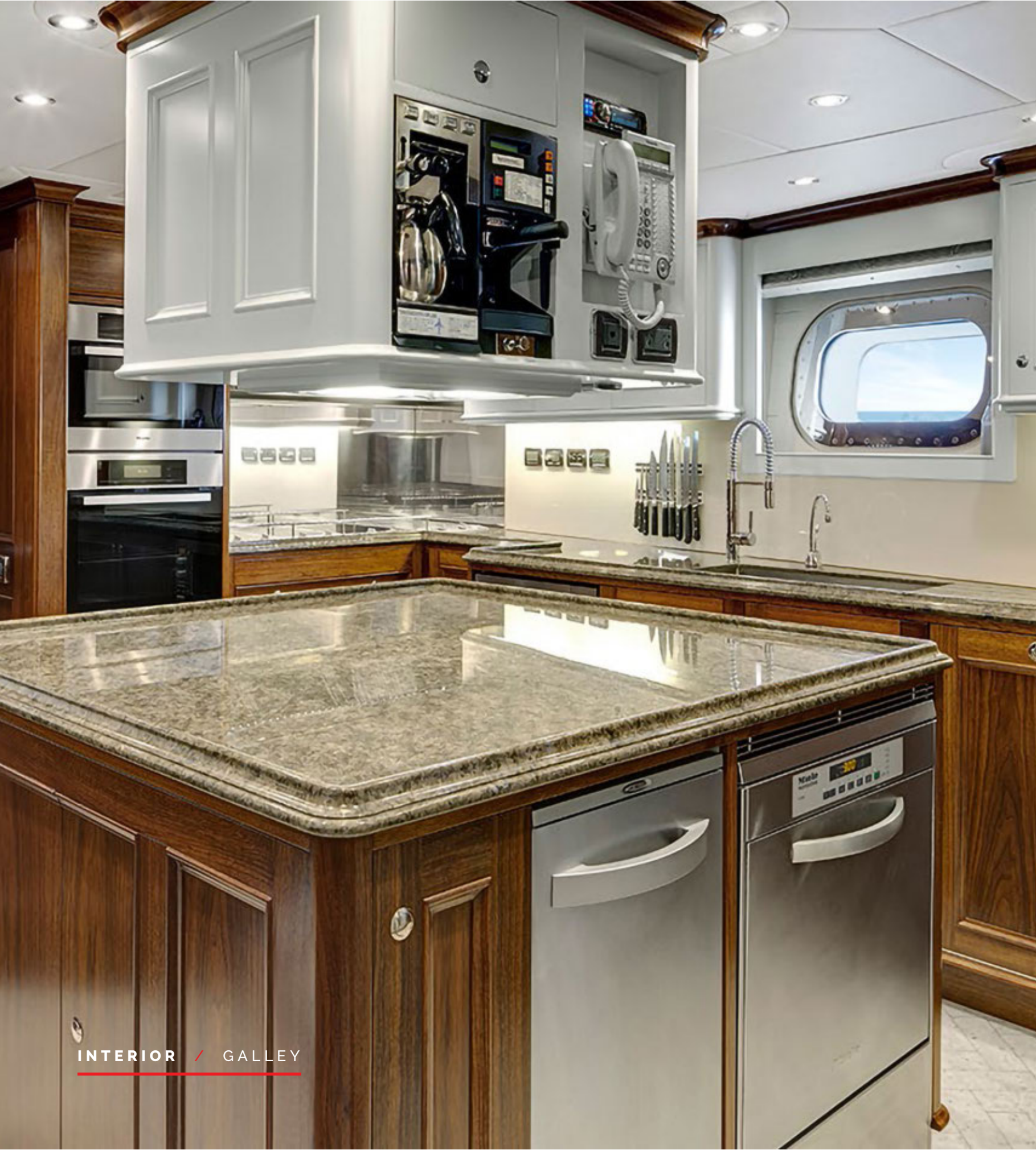
INTERIOR / GALLEY