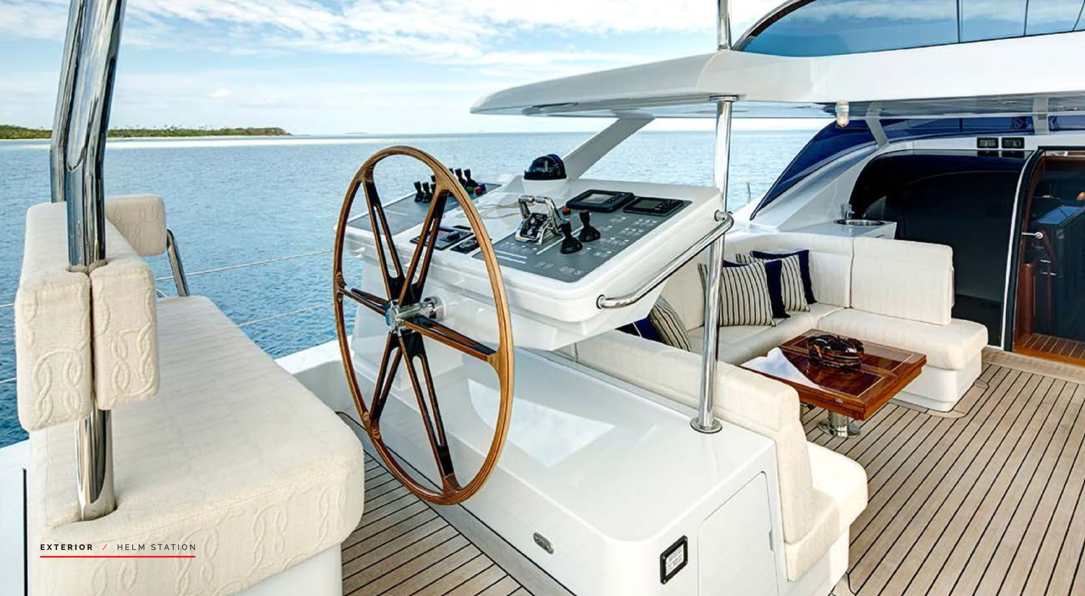
EXTERIOR / HELM STATION