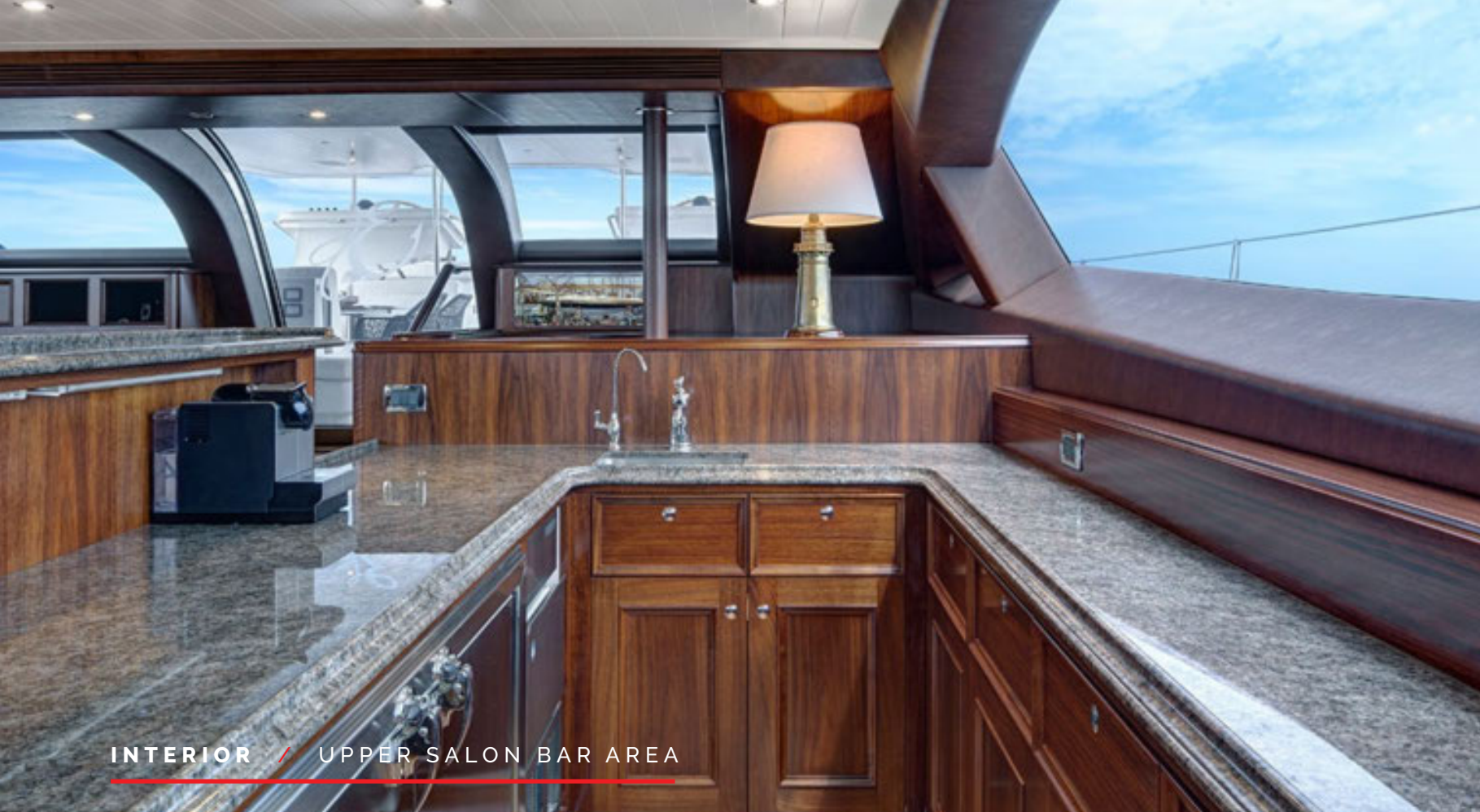
INTERIOR / UPPER SALON BAR AREA