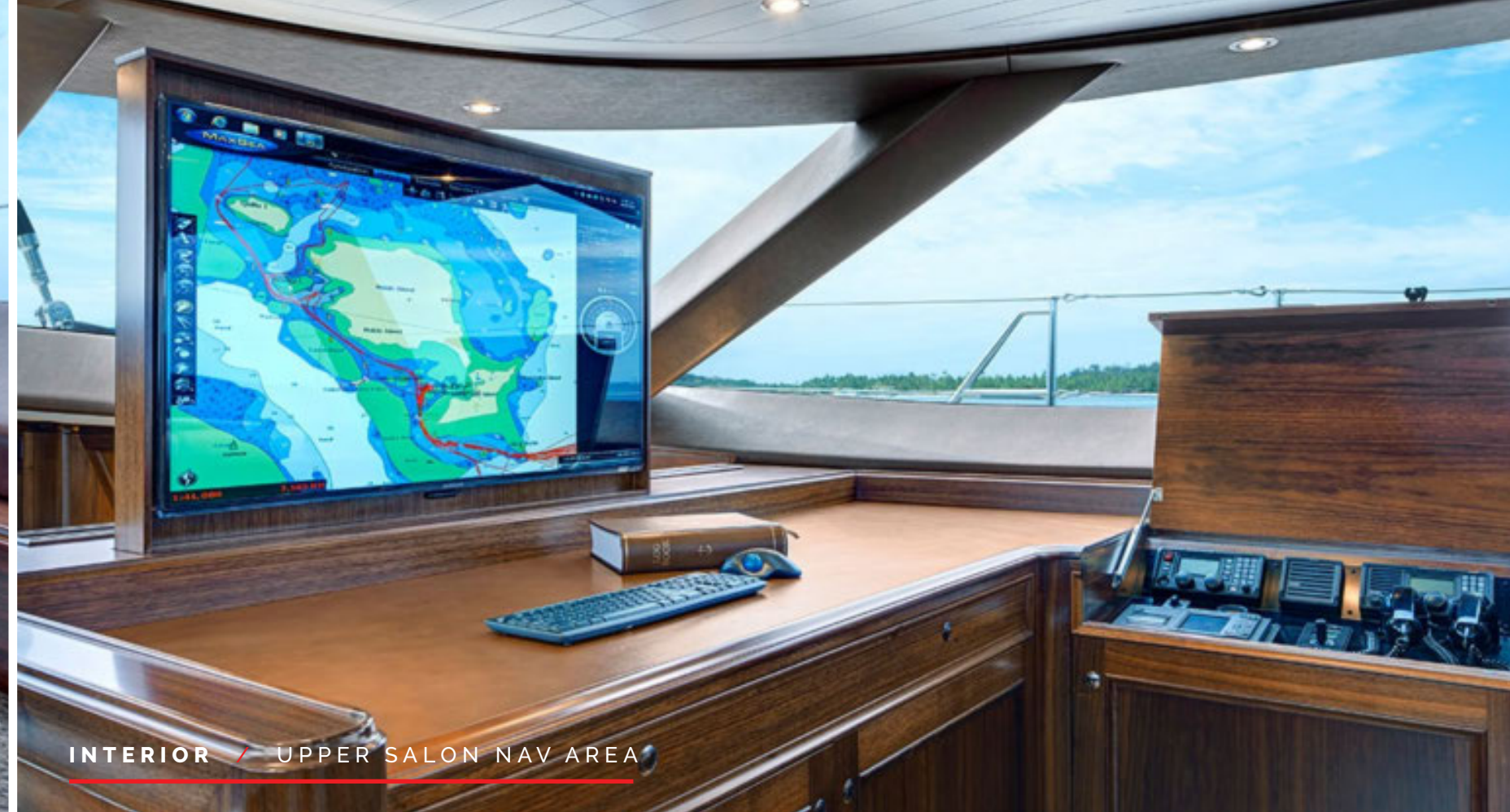
INTERIOR / UPPER SALON NAV AREA