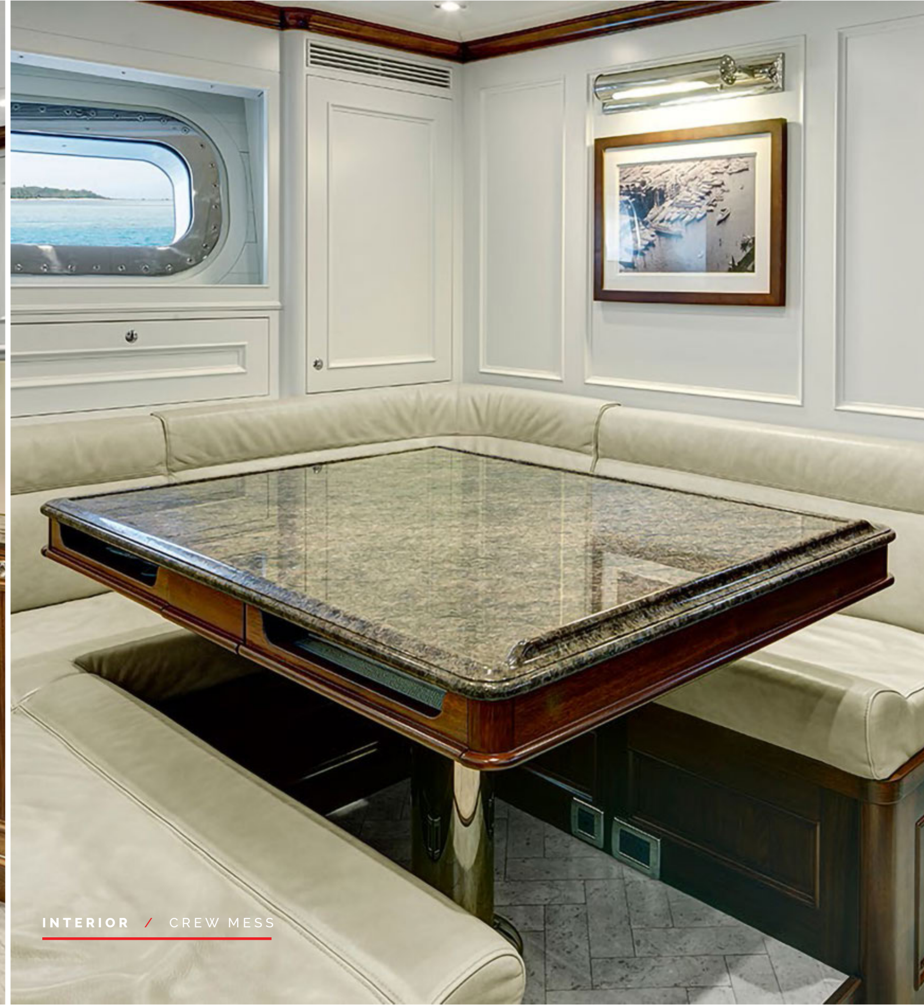
INTERIOR / CREW MESS