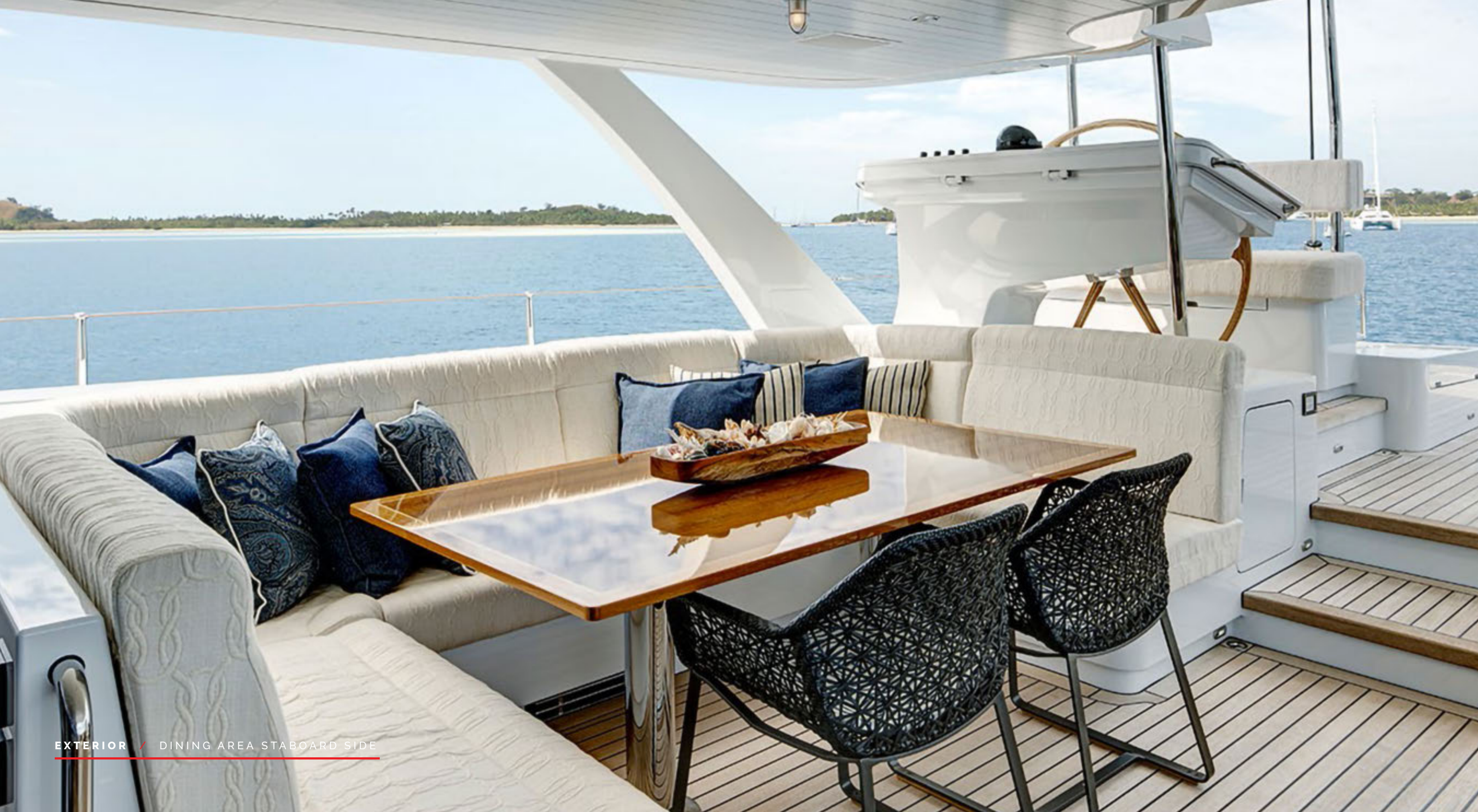
EXTERIOR / DINING AREA STARBOARD SIDE