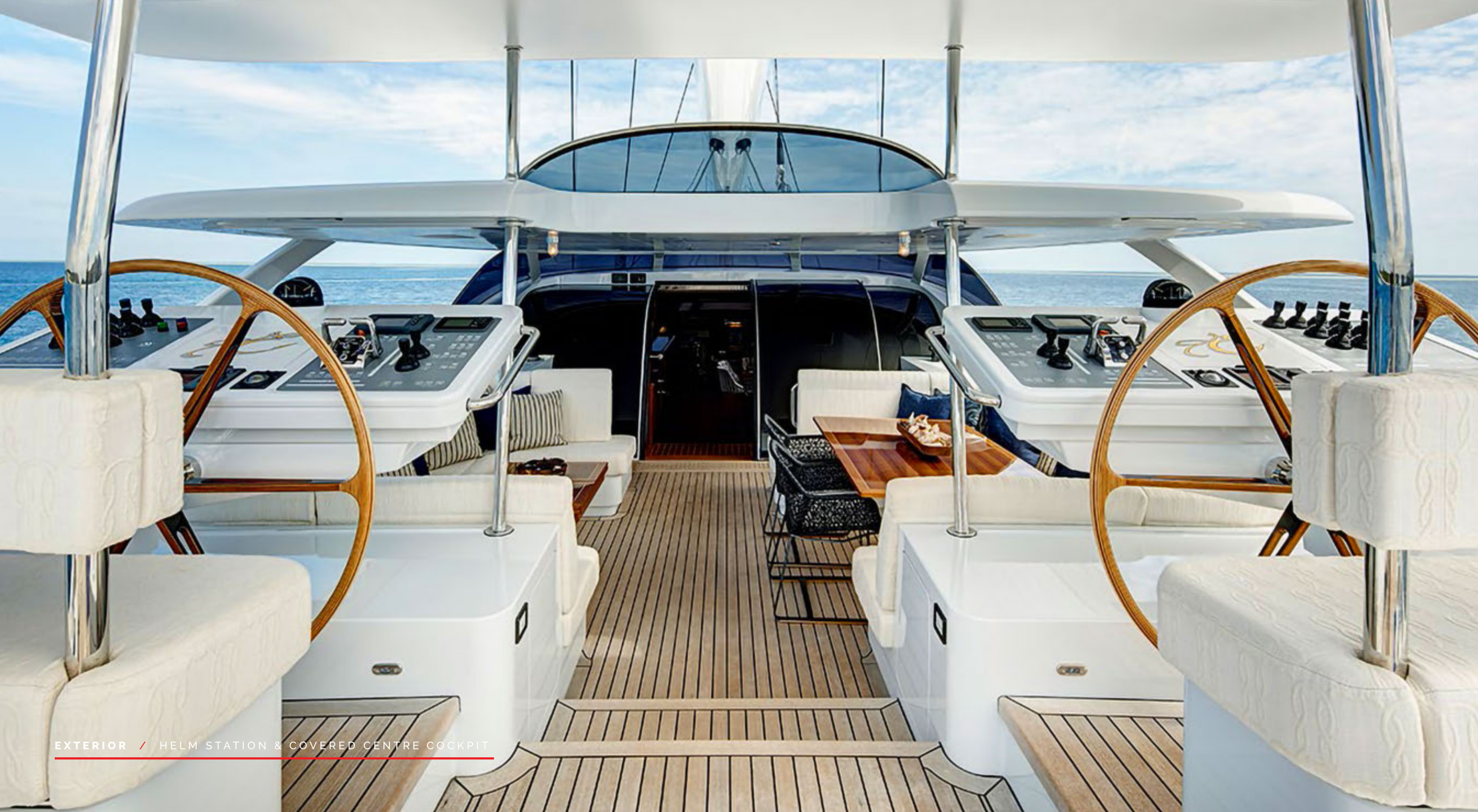
EXTERIOR / HELM STATION & COVERED CENTRE COCKPIT