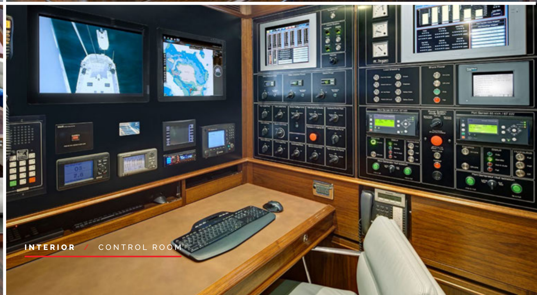
INTERIOR / CONTROL ROOM