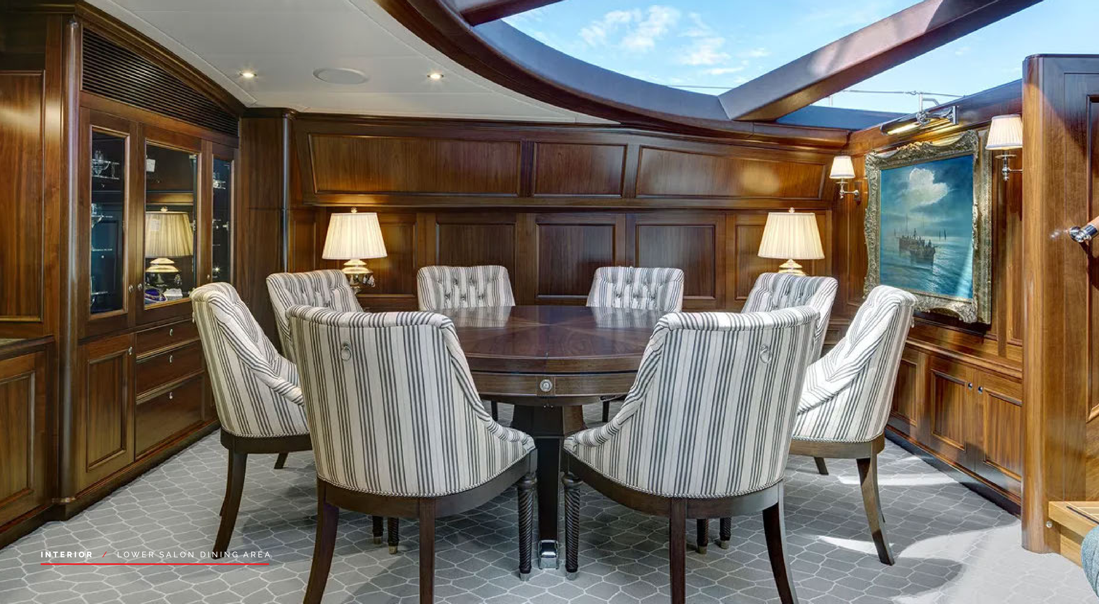
INTERIOR / LOWER SALON DINING AREA