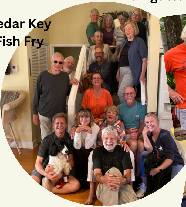
Cedar Key Fish Fry