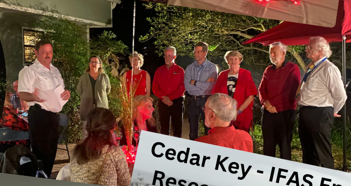
Cedar Key - IFAS Env. Research Ctr Tour & Cookout at Teiss residence