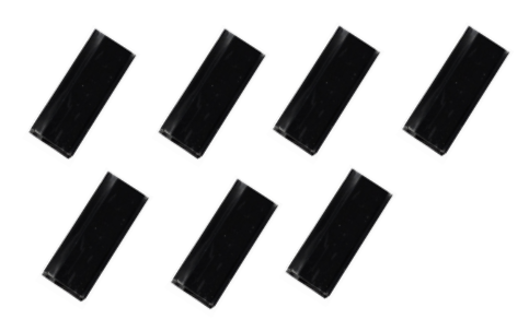
7 Windshield Clips

Note: When unpacking windshield, do not remove protective covering with a scraper, razor blade or other tool that may scratch the windshield.