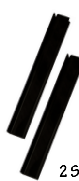
2 Strut Brackets