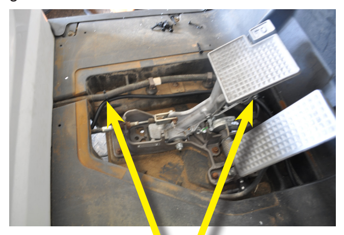
Zip Tie Locations (location at right of photo is behind brake pedal)

12. To fasten wiring harness to vehicle use the supplied zip ties. MadJax recommends fastening the wiring harness to frame members in the front of the vehicle in order to prevent the harness from making contact, rubbing, or being pinched by moving parts, such as the suspension. Use two zip ties in the pedal assembly area, as shown, to tie the wiring harness to the main wiring harness. Tie the wiring harness to the main harness at the back of the battery compartment as shown.