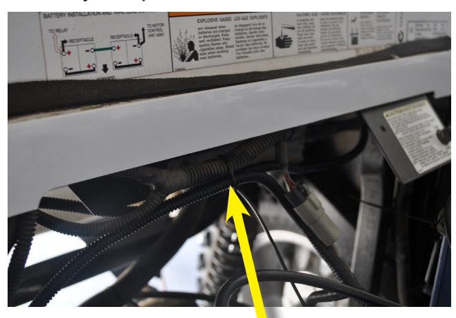
Zip tie to main harness at rear of battery compartment.

IMPORTANT: How you connect the wiring harness to your cart's battery pack will depend entirely on your cart's battery pack configuration. Take care not to supply too much voltage to the unit as this will cause a failure that is not covered by manufacturer's warranty.