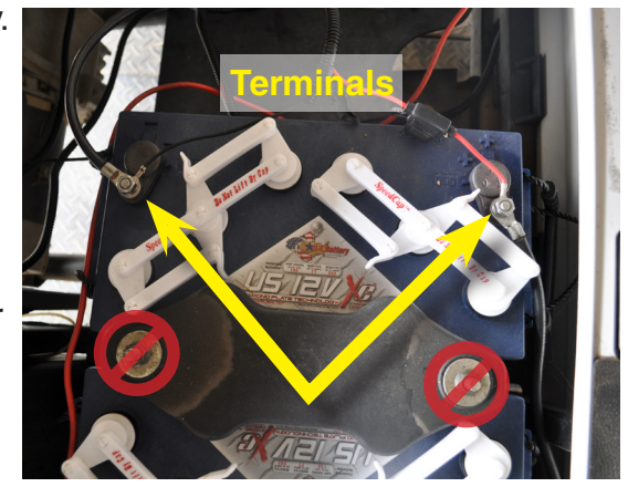
Yamaha® Drive® with 12V Battery Configuration

If your cart is equipped with SIX 8V batteries, you will need a 16V to 12V voltage reducer, such as the MADJAX MJ1612VR. In this case, you will connect the voltage reducer across TWO of the 8V batteries, and then connect the wiring harness to the appropriate connections on the voltage reducer.