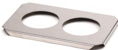
Perforated cover for using beakers