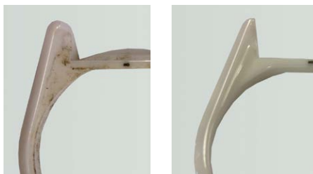
Removal of polishing pastes