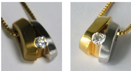
Removal of polishing pastes