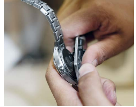
Cleaning of watch parts like straps, cases, etc.

Elmasonic xtra TT tabletop ultrasonic devices are designed for use in production environments, workshops and servicing. Features like the permanently integrated Sweep-function, the switchable Dynamic-function or the individually settable limit temperature with LED warning indicator make the cleaning of parts in day to day work much easier.