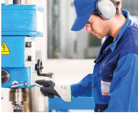
Industrial parts cleaning of motor parts, filters, etc.

Robust tabletop ultrasonic devices for heavy-duty applications