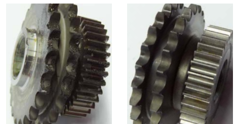
Removal of grease and silicone