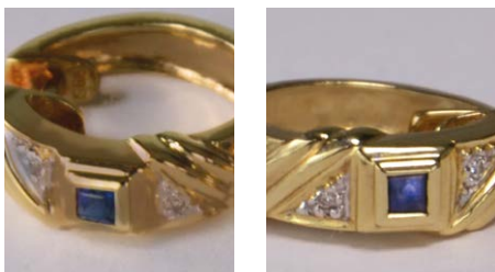
Removal of wear dirt