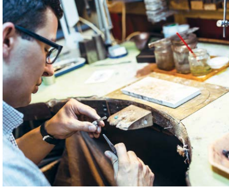
Cleaning of rings, necklaces, earrings, etc.