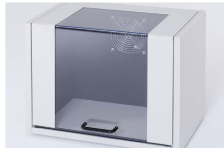
Noise protection box