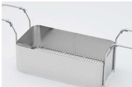
Baskets made of stainless steel