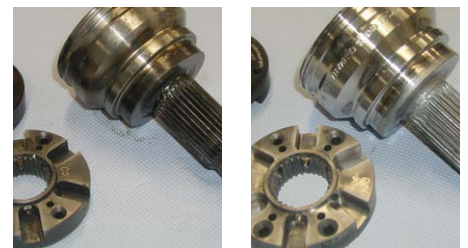
Removal of oxidation and other contaminants