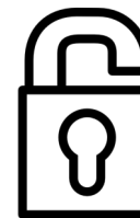
Christian & Muslim Relationships