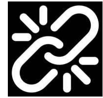
Engaging the Church