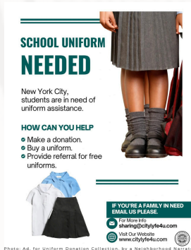
Photo: Ad. for Uniform Donation Collection, by a Neighborhood Narrator