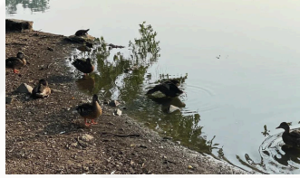
PHOTO: LAKE SIDE DUCK PROSPECT PARK, PARADE STREET ENTRANCE

In this quarterly report of - We Love Parks @OpenRoadNYC & @CityLyfe4u, introduces 5 parks out 1700 NYC Parks