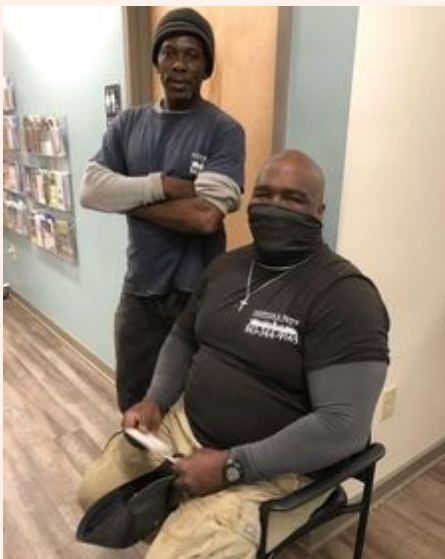
Left: Two brothers wait to receive their vaccinations

The Smith Medical Clinic has been giving out the Moderna COVID-19 vaccine at both locations since March. We have given 800 vaccinations to patients to date!