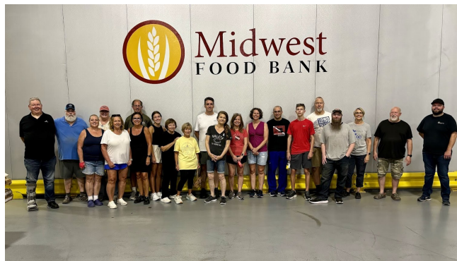
Servants of our Lord Ministry, Inc.

If you are interested in being a team player locally in our area with Servants of our Lord Ministry, please refer to this link to sign up https://shorturl.at/dmV15 or scan this: