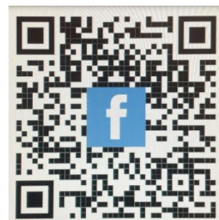
Visit us on Facebook