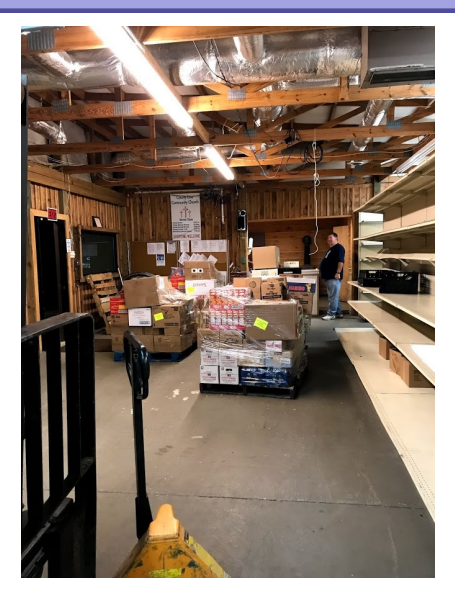
County Line Pantry is operated by County Line Community Church and is located in Hazard, Kentucky. The pantry serves 1,800 people annually in Perry County of Eastern Kentucky.

In November the church was able to distribute food to over a hundred households affecting nearly 200 individuals. County Line gave out food totaling over $12,000.