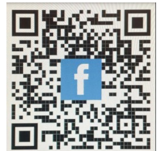
Visit us on Facebook