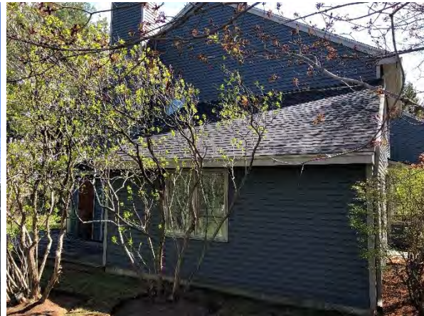
Bld 13 West