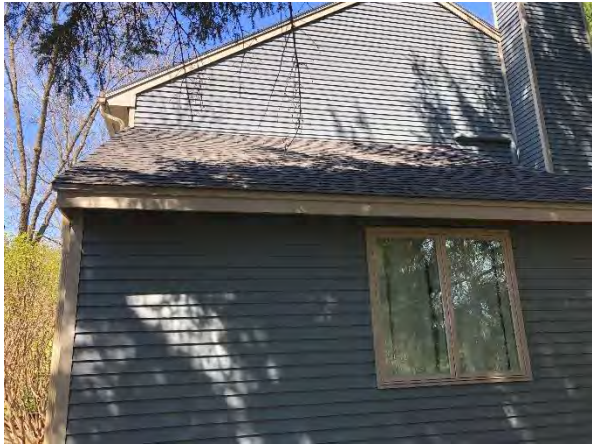
Bld 13 East