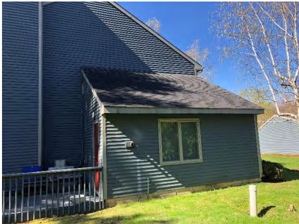
Bld 8 East side shed