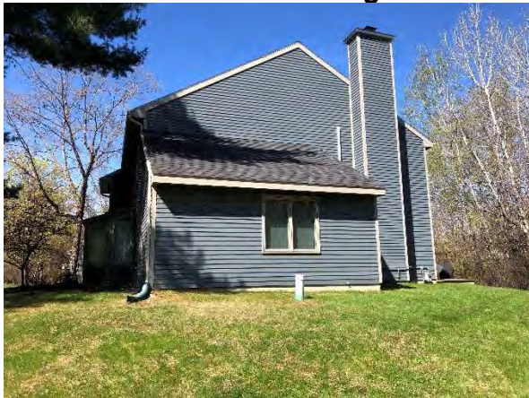
Bld 11 East Shed