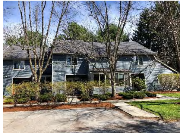
Bld 13 South