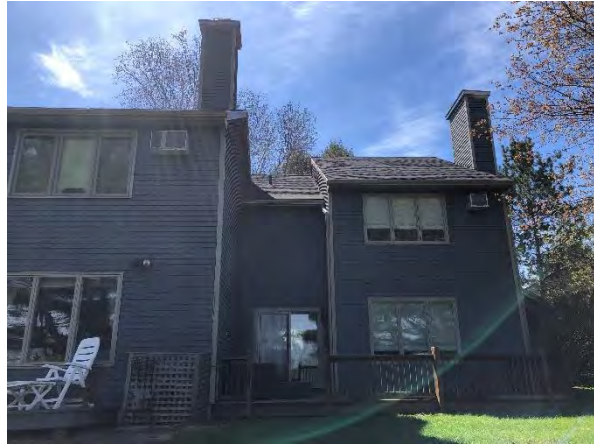
Bld 14 North