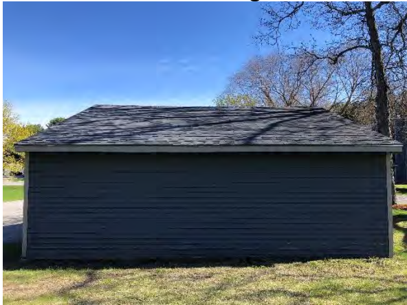
West Garage west side