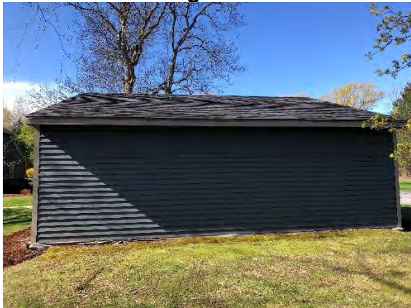
West Garage west side