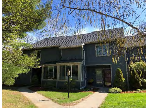
Bld 10 West