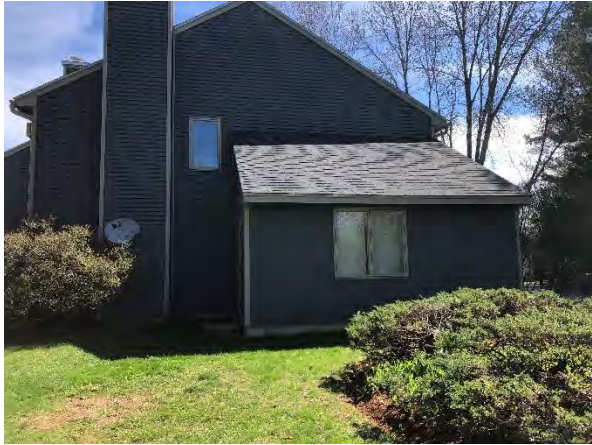
Bld 14 West