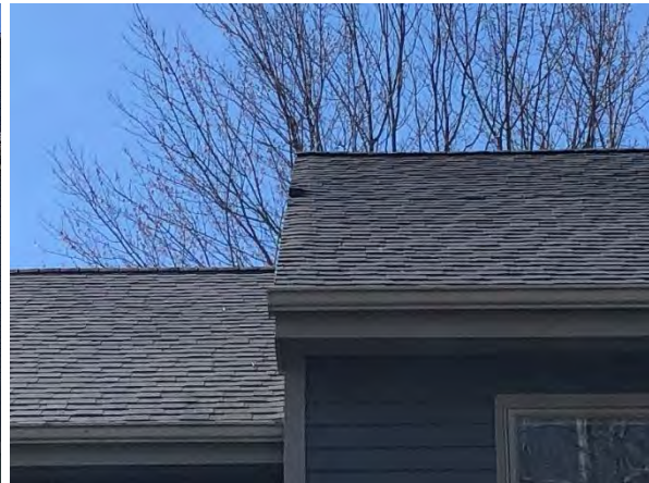
Damaged shingles above unit 50