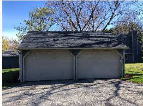
East Garage east side