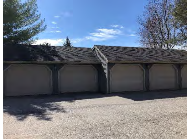
North side both garages