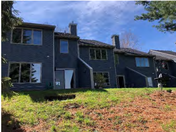
Bld 14 East