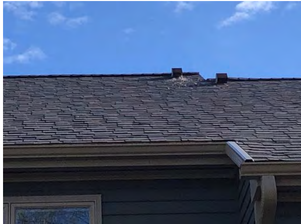
Plugged vent unit 2