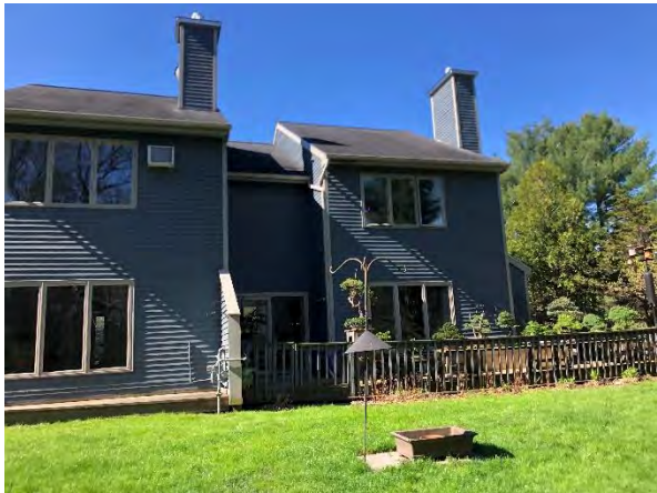
Bld 9 South