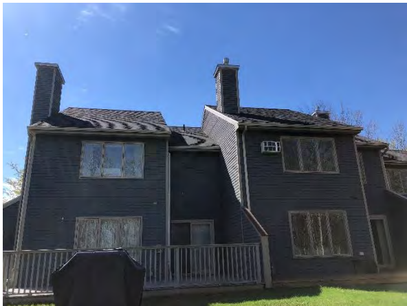
Bld 12 North