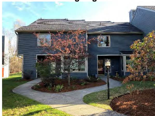
West side Bld 1