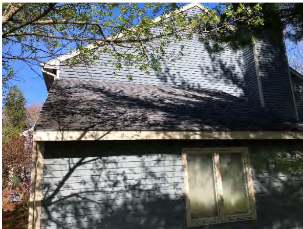
East Shed roof