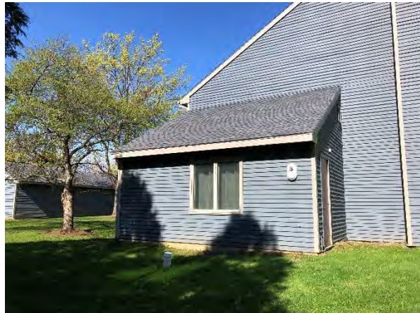
Bld 9 West