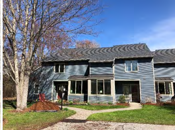
Bld 12 South