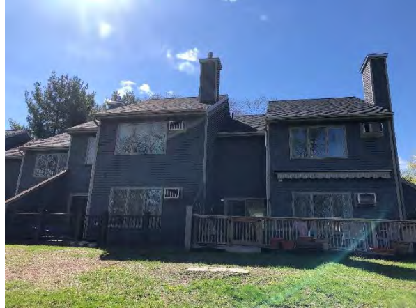
Bld 11 South side