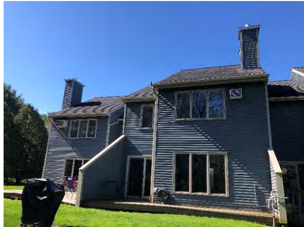
Bld 9 south