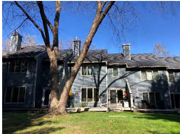
Bld 8 South side