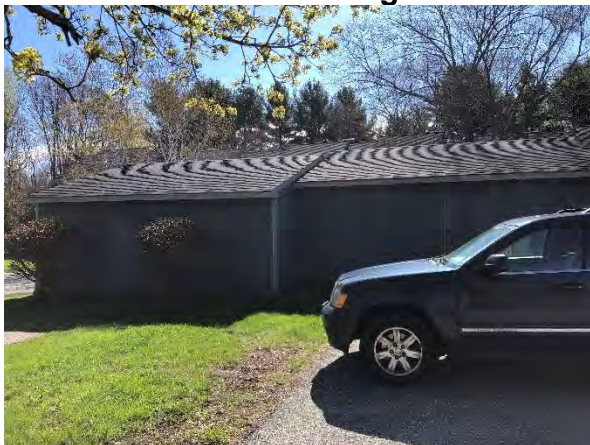
Garage units 32-35