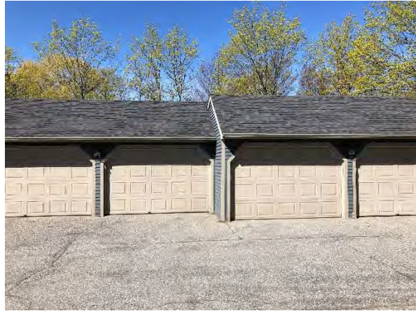
Bld 11 Garage East