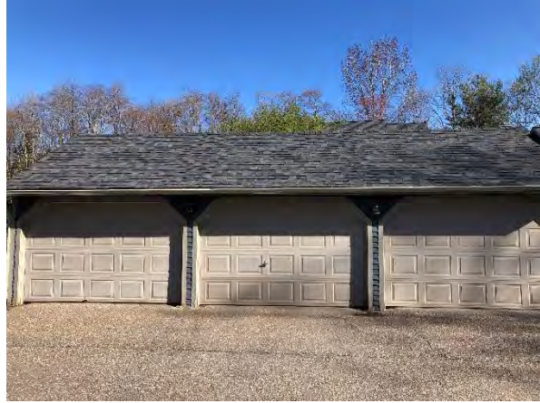
Garage north side