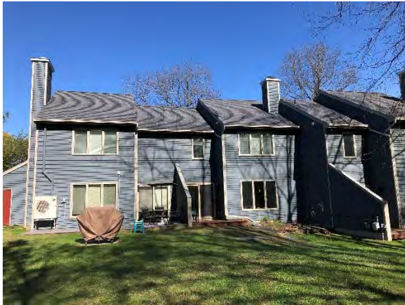
Bld 7 South side