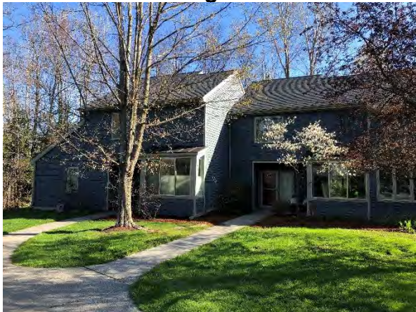
Bld 2 west