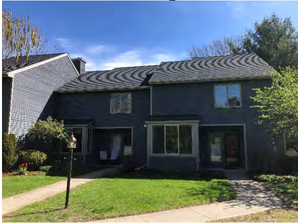
Bld 10 West