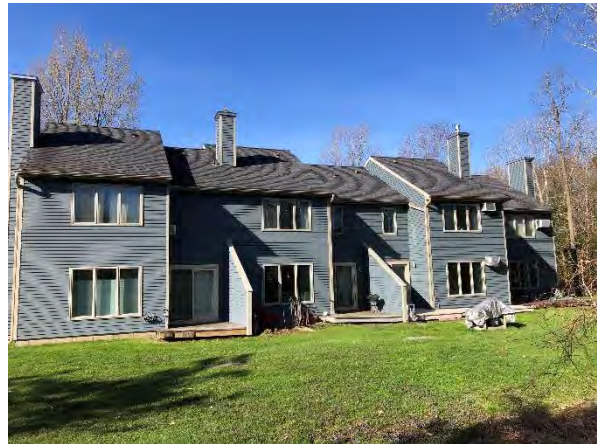
Bld 2 East side