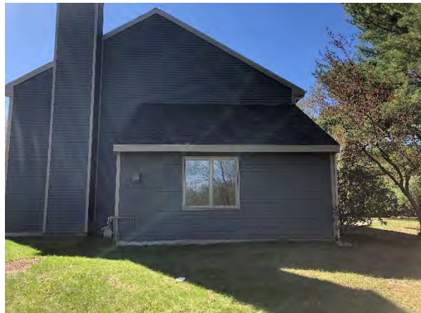
Bld 10 North