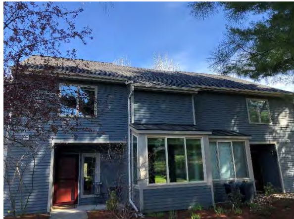
Bld 11 North