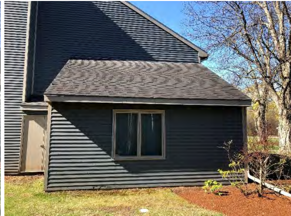
Bld 7 East shed roof