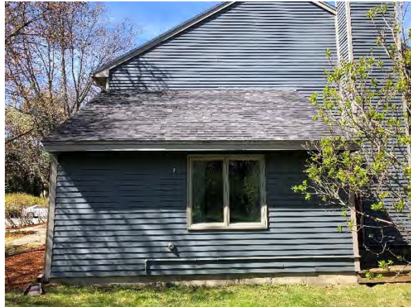
Bld 14 South

This is a well maintained, nicely landscaped project. Please be in touch if we can provide you with any additional assistance.