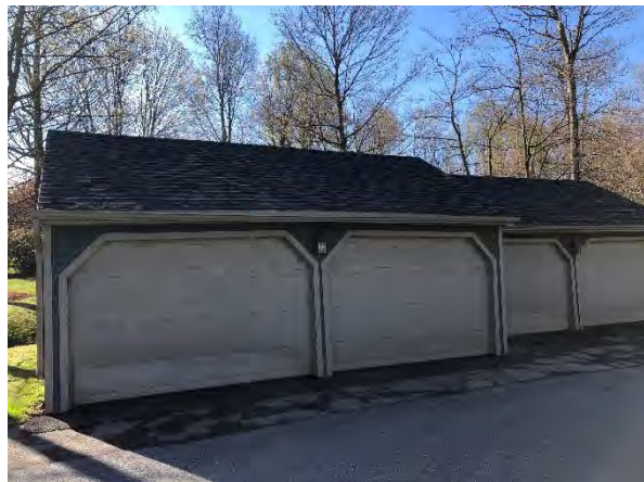
Garage North side