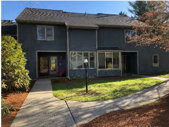
West side Bld 1