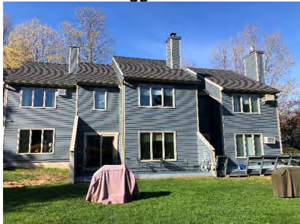
East side Bld 1