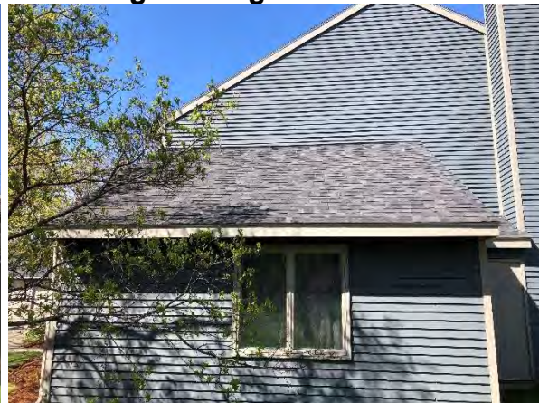
Bld 12 East