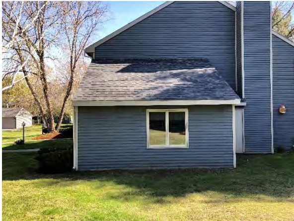
Bld 8 West side shed