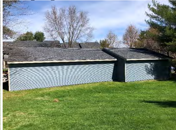
South side both garages