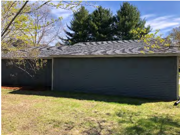
Bld 11 Garage West