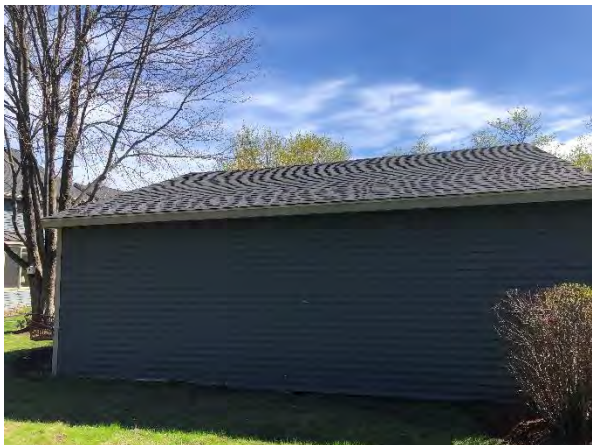
Bld 12 West garage West side