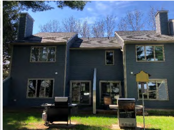
Bld 13 North