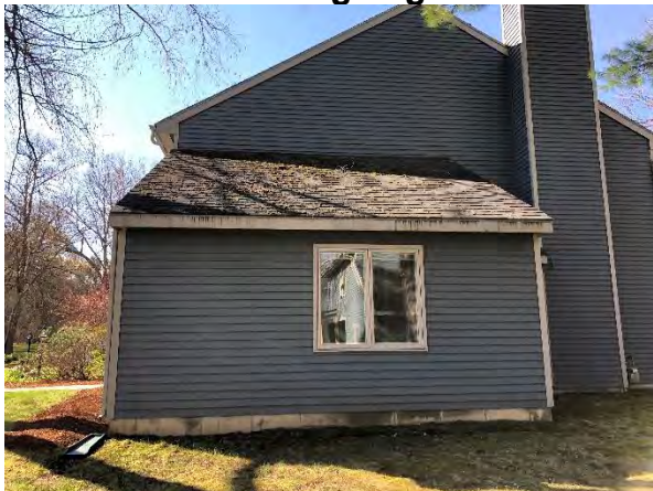
North shed roof