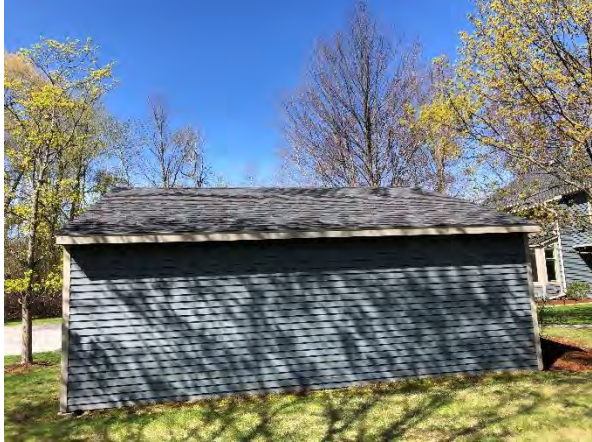
Bld 12 East garage East side