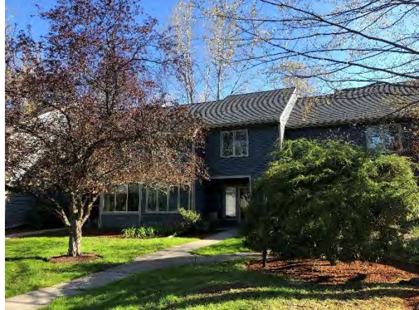
Bld 2 West