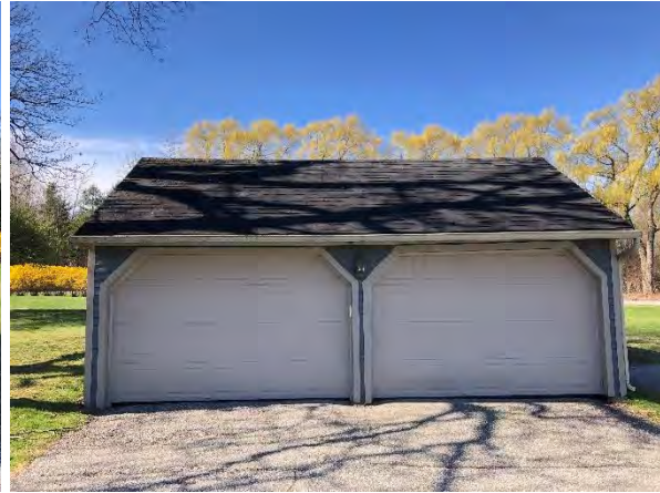
West Garage east side