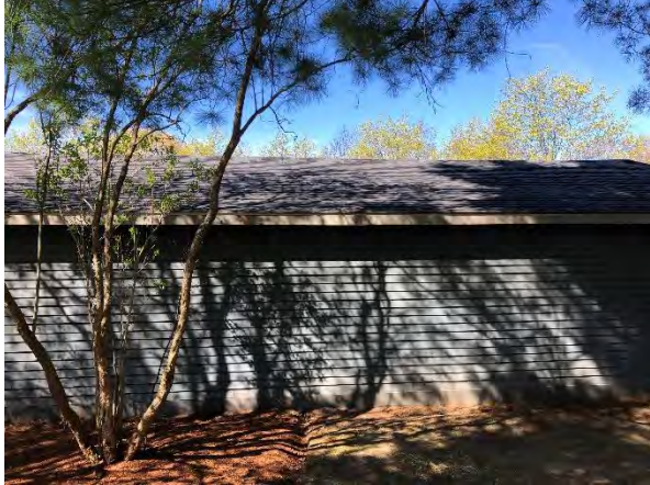
Bld 10 Garage east