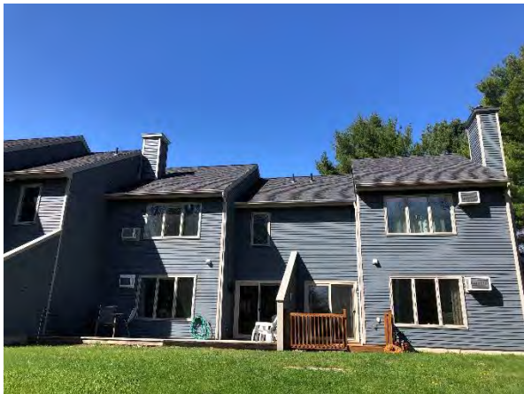
Bld 10 East