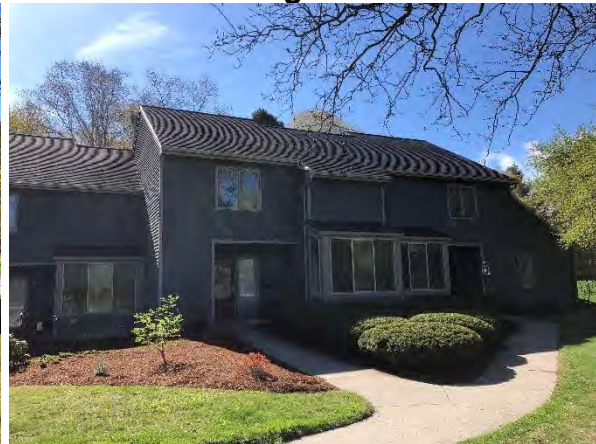
Bld 7 North side