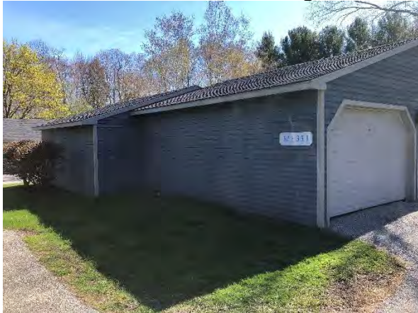
Garage units 30-31