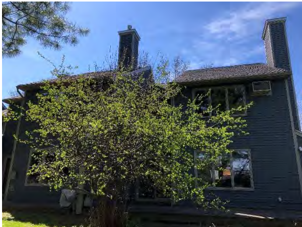
Bld 13 North