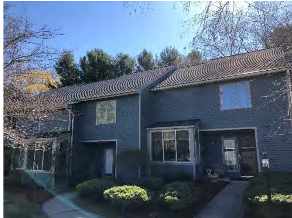
Bld 8 North side