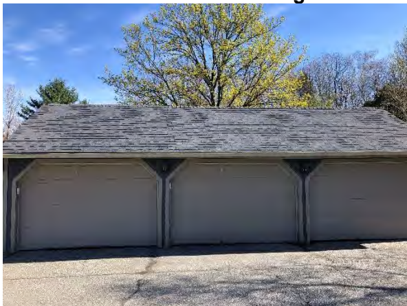
Bld 9 Garage West side