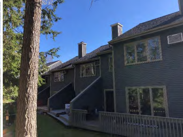
West side 16-21