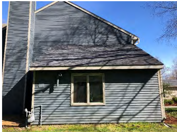
South shed roof