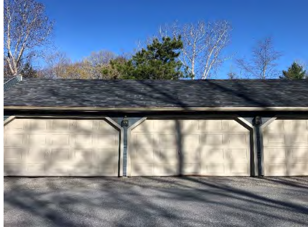
Garage north side