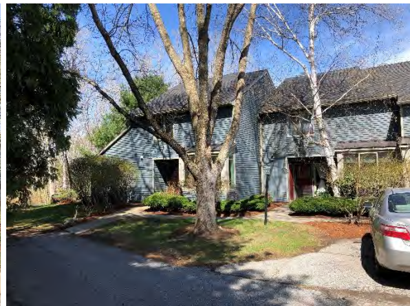
Bld 14 South