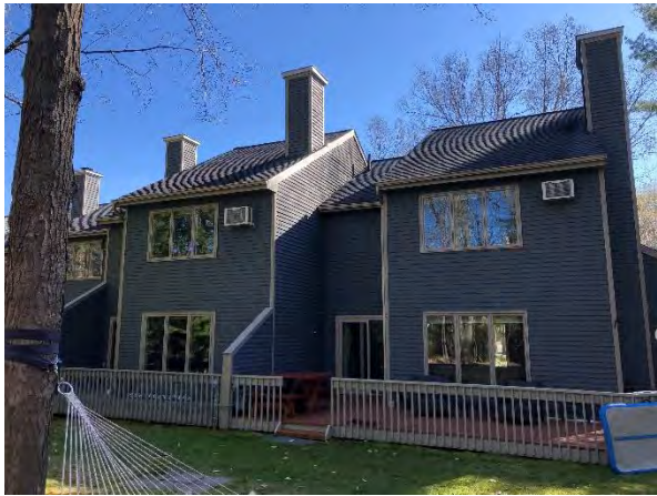
West side 16-21