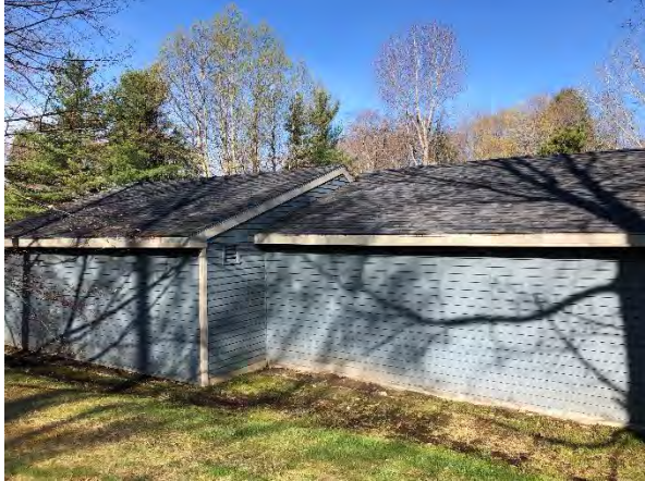
Garage south side