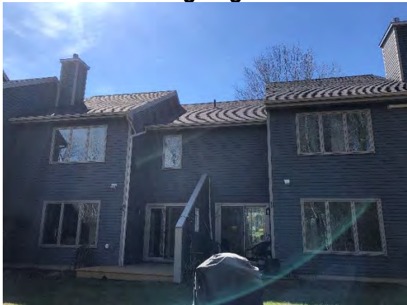
Bld 12 North