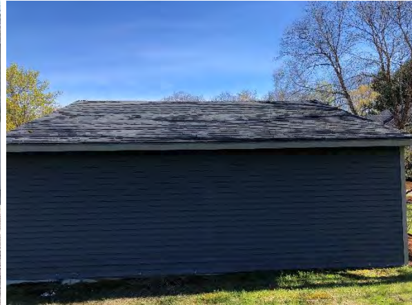
East side Garage 30-31