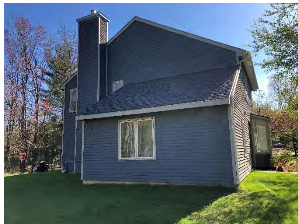
West shed roof