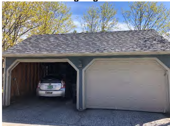
Bld 12 East garage West side