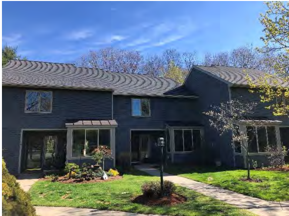
Bld 9 north