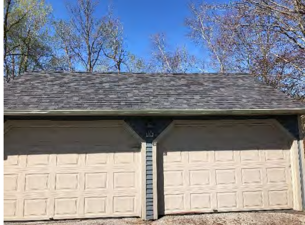
Bld 12 West garage East side