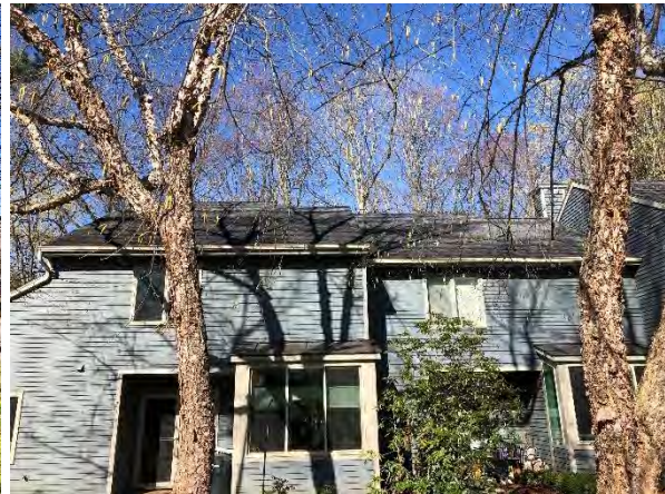
East side 16-21