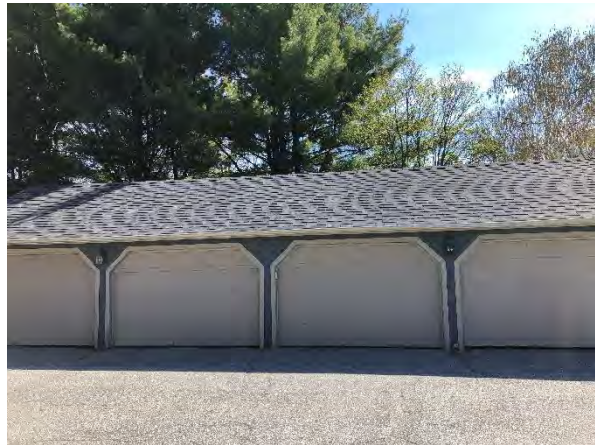
Bld 10 Garage west