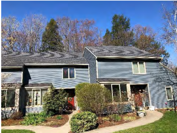
East side 16-21