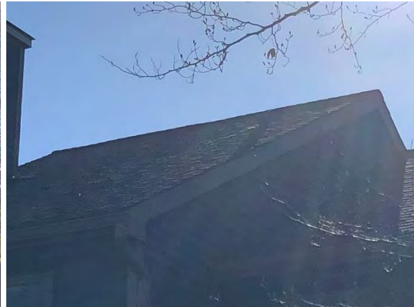
Plugged vent unit 11