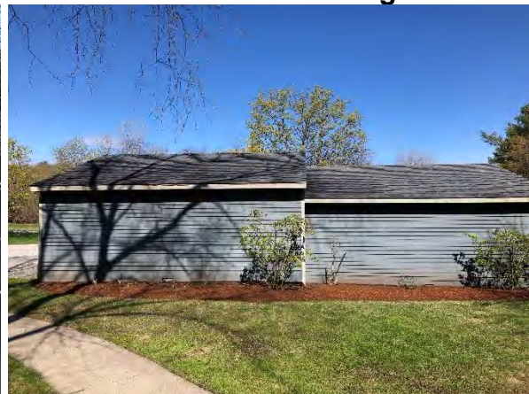
South side Garage 32-35