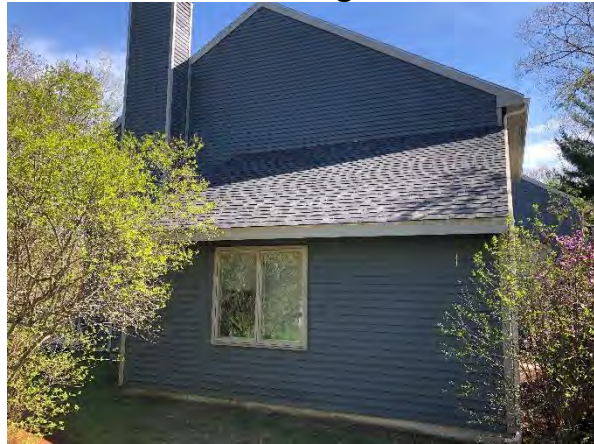
Bld 11 West Shed