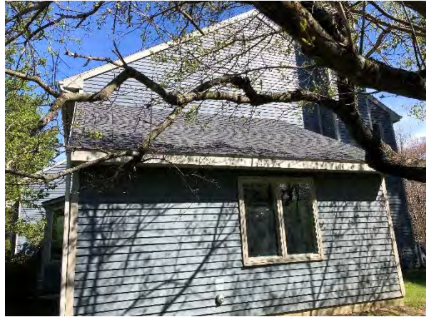
Bld 10 South