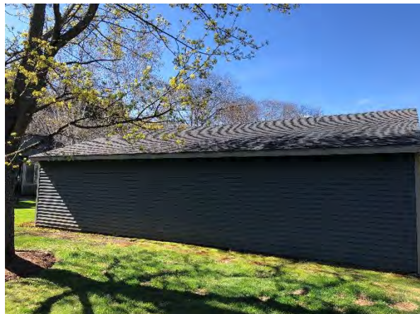
Bld 9 Garage East side