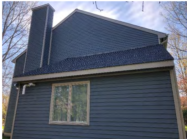
Shed roof North side