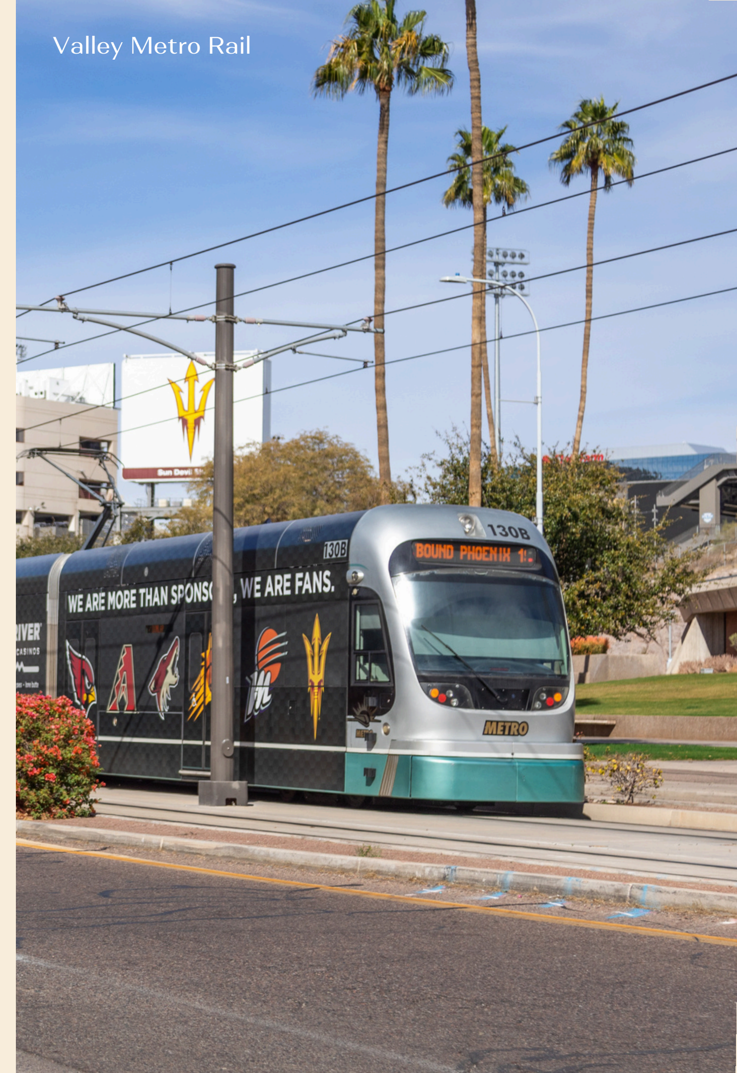
Valley Metro Rail

Information and vendor referrals for group transportation, including shuttles and motorcoaches, is available upon request.